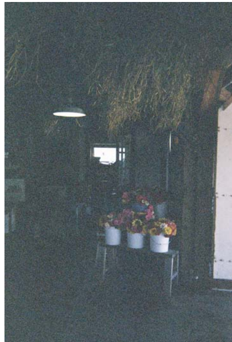
Photovoice Image 2: CSA Set Up

“This is such a good picture of Finn. I chose this picture, because it took us like twenty minutes to get him to sit like this, and I’ve had lots of fun with him.”