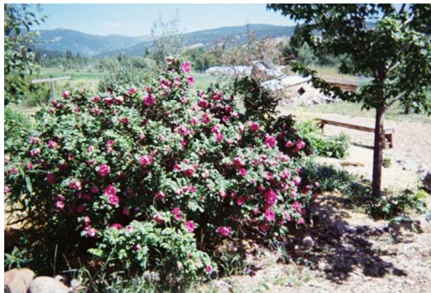
Photovoice Image 5: The Roses

In addition to the tangible results of harvested food, one of the primary goals for all Youth Harvest participants is to complete a season successfully. As the Drug Court Judge explains, Youth Harvest participants “take our local, nonprofit garden from the very beginning stages to the very ending stages, so it’s a complete experience, ideally.” This goal is represented in the table of Therapeutic Factors as “personal accomplishment.” As the current director says, “To start something and to finish something is huge for some of these kids.