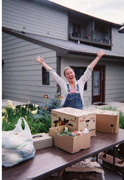
Photovoice Image 6: Hot Day's End

“I picked this one because it was the end of one of the hottest Mobile Market days, and we were so excited.”