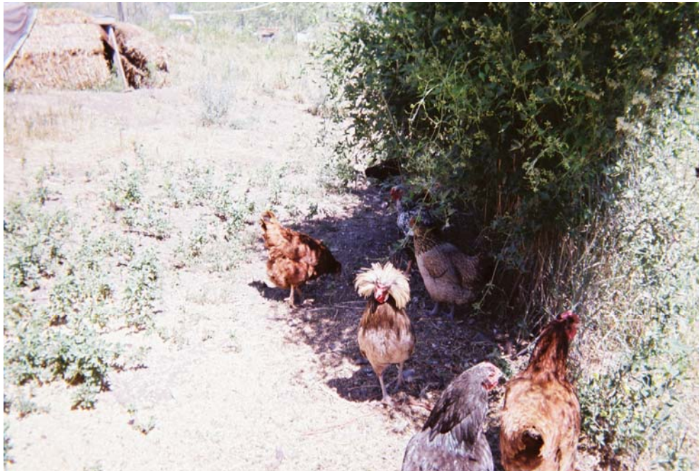
Photovoice Image 10: Chickens and Cock

“I like the picture of the Orchard Gardens with the sweet pea blossoms off to the right. It looks like there’s a big old storm coming in the back. The sky is all dark. And then the bright red flowers.”