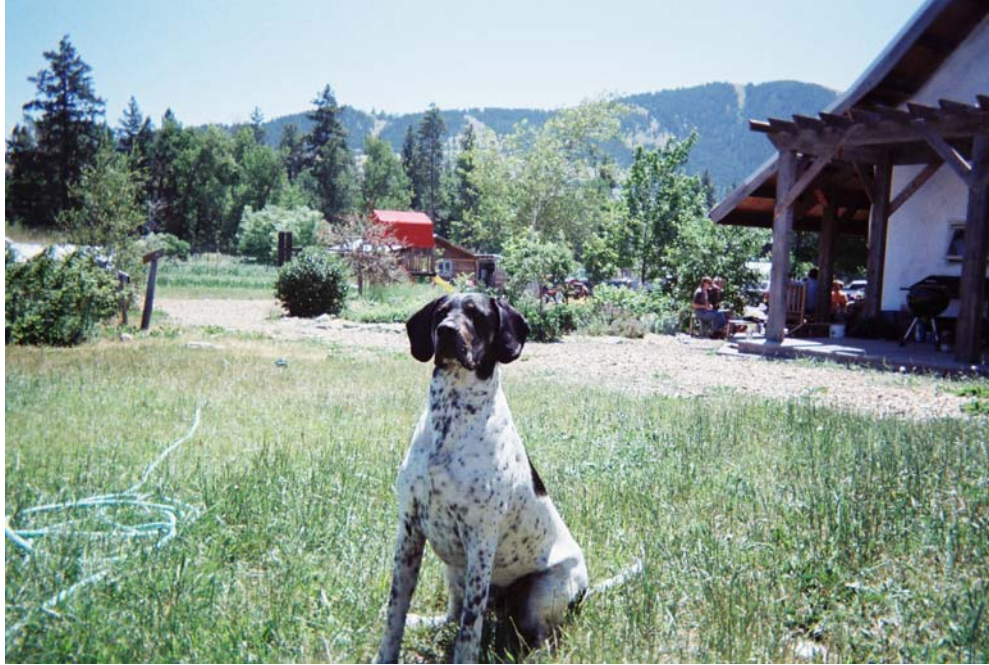
Photovoice Image 1: Finn

“This is such a good picture of Finn. I chose this picture, because it took us like twenty minutes to get him to sit like this, and I’ve had lots of fun with him.”