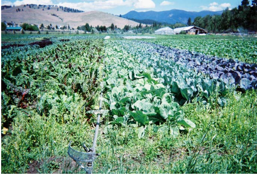
Photovoice Image 7: Rows of Greens

“I picked this one because it’s sick looking. It’s got the landscape and all that. And each row is a different color than the next one.”