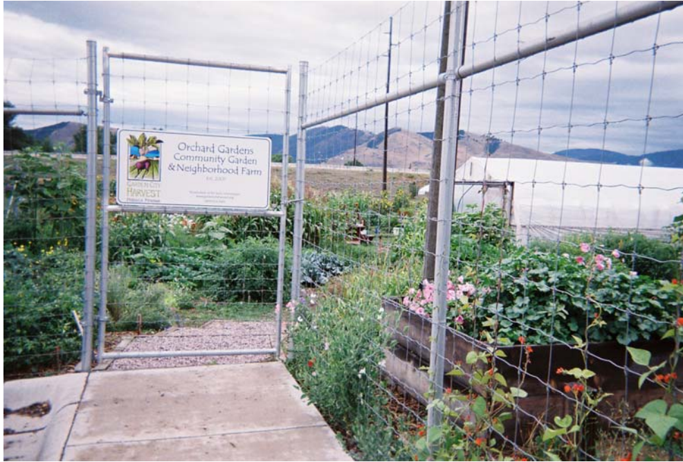
Photovoice Image 9: Orchard Gardens

“I like the picture of the Orchard Gardens with the sweet pea blossoms off to the right. It looks like there’s a big old storm coming in the back. The sky is all dark. And then the bright red flowers.”