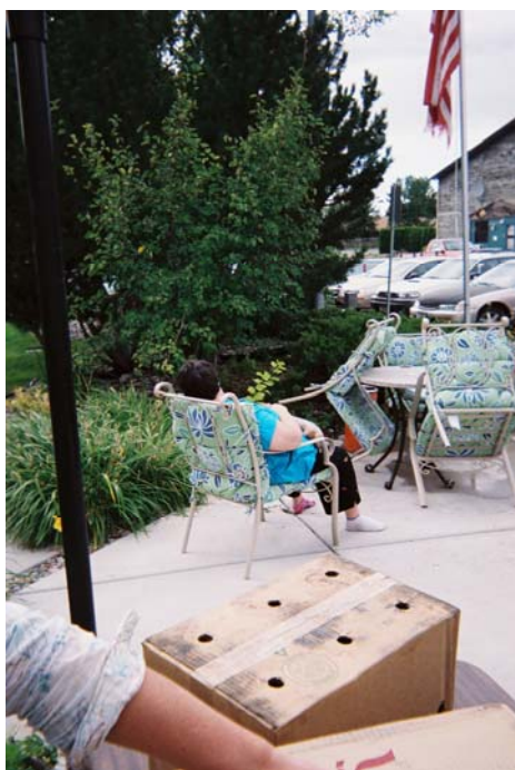
Photovoice Image 12: Mobile Market Customer

“This woman, you can’t really see, because she turned away right as I took it, but she’s mentally disabled, and she always comes down just to talk to us. This was the first day she bought anything. I took this picture just two weeks ago. She’s been there everyday we’ve come this summer and she finally bought something. She’s just super fun.”