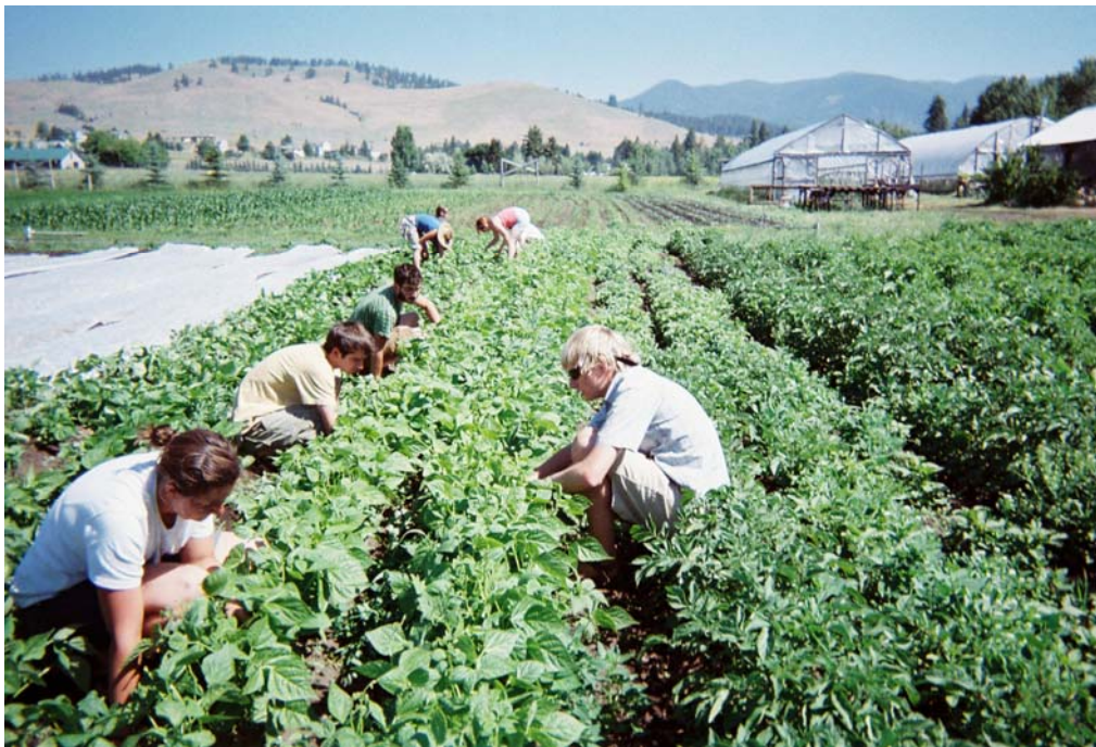
Photovoice Image 4: Hard Work

The Drug Court Judge repeatedly mentioned that what the Youth Harvest participants do up at the farm is “hard work.” He also shared, “I know there’s an old analogy that if these kids were just out on a farm during the summer, they’d get well. We don’t have that approach anymore in justice or in families. I know families used to send their kids out to the farm in the summer, and I know... historically, troubled kids have gone out to agriculture to sort of get straightened out. I don’t know what the actual data was, but there are stories, and there are experiences where that’s happened.”