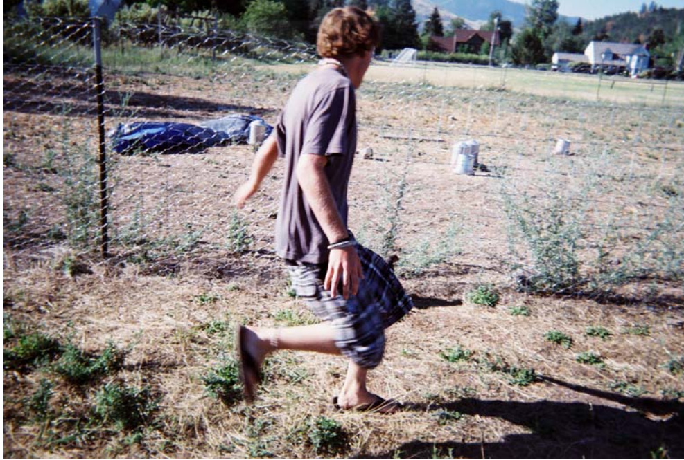
Photovoice Image 3: Chicken After Chickens