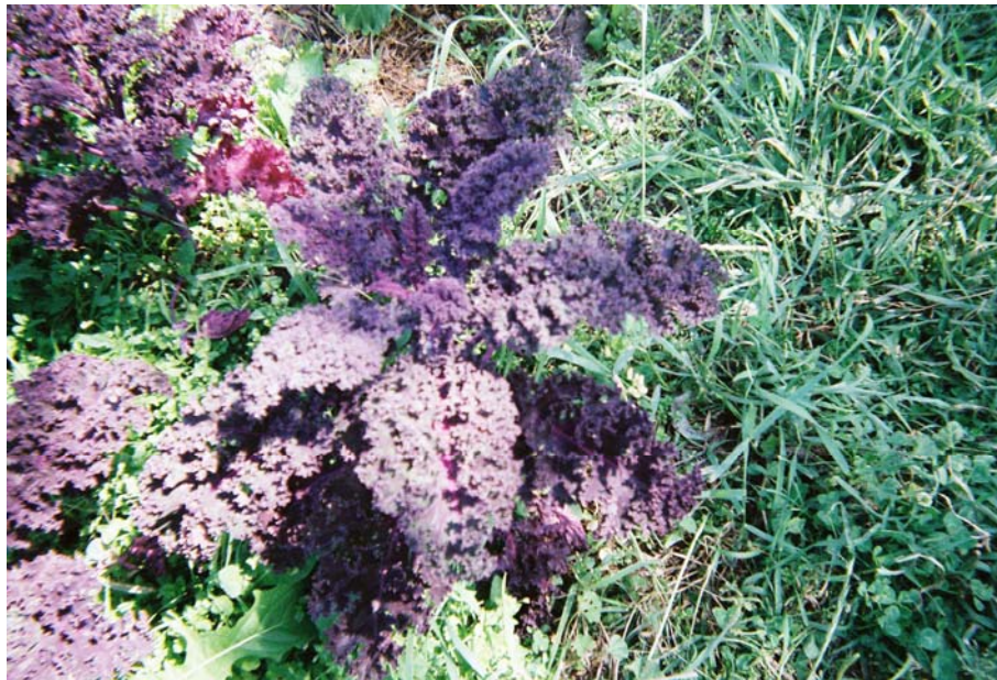
Photovoice Image 8: Purple Kale

“I picked this one because it’s sick looking. It’s got the landscape and all that. And each row is a different color than the next one.”