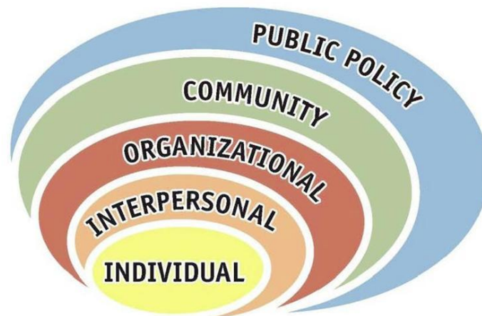
FIGURE 1: THE SOCIO-ECOLOGICAL MODEL

To ensure that all levels of influence on the health and well-being of transgender people were being examined during this study, the socio-ecological model (SEM) was utilized.