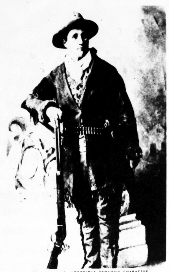
CALAMITY JANE NOTORIOUS FRONTIER CHARACTER GEN CROOK'S SCOUT