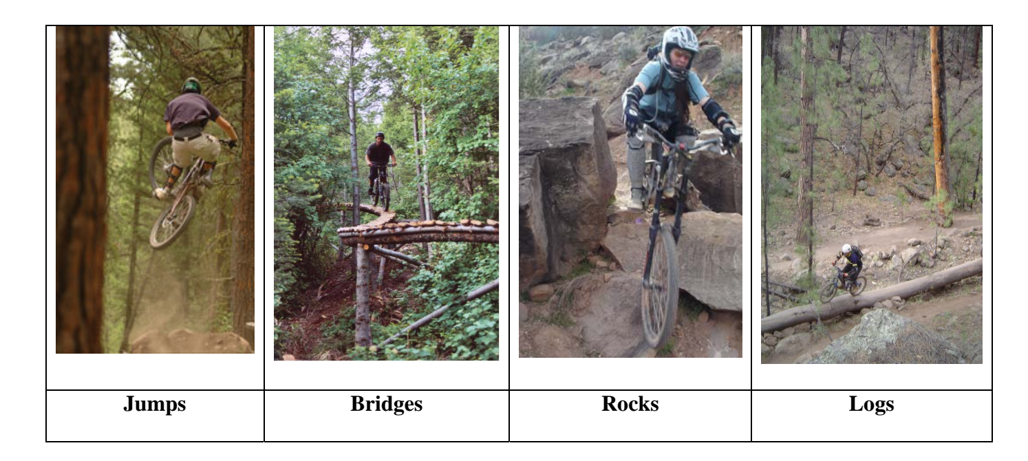
Exhibit 1: Freeriding Photos

Photo Exhibit 1), but seems to have more to do with the mentality of the rider than the terrain. Although the word "freeride" was developed to attempt to distinguish this type of mountain biking from other types of cycling, there was an immediate backlash against the term. Riders especially were divided in its usage. Some riders embraced the term while others made fun of it, calling it "fun riding," or donning 1970s afro wigs and referring to themselves as "froriders." There was an observable resistance to being labeled which did more to define freeriding than did the term itself.