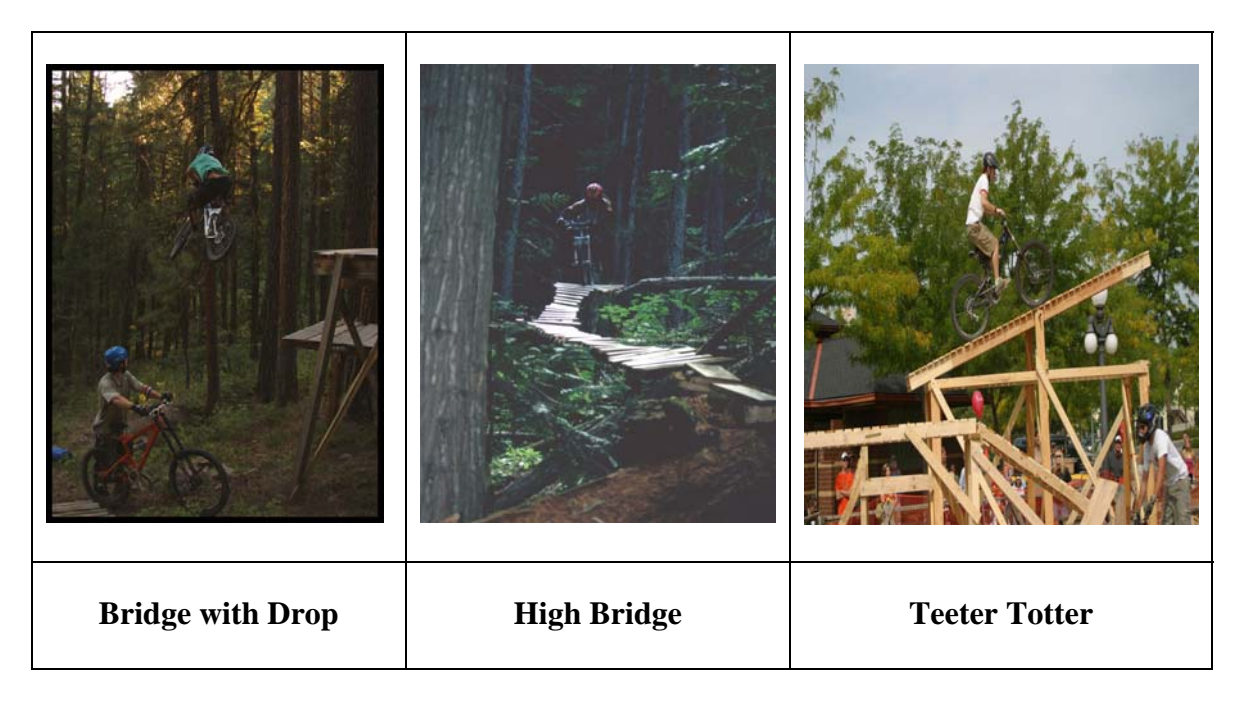
Exhibit 2: Stunts

North Shore style bridges vary in width and height, and may include teeter-totters or large drops. These bridges or stunts began to pop up all over British Columbia before making their way to the United States. One Bike Magazine editor calls this spreading out of North Shore style riding the "North Shore Virus" (Scott 2004, p.45), and claims that it is being seen all over the world. The North Shore is indisputably the core of where freeriding began, and in this everyone seems to agree.