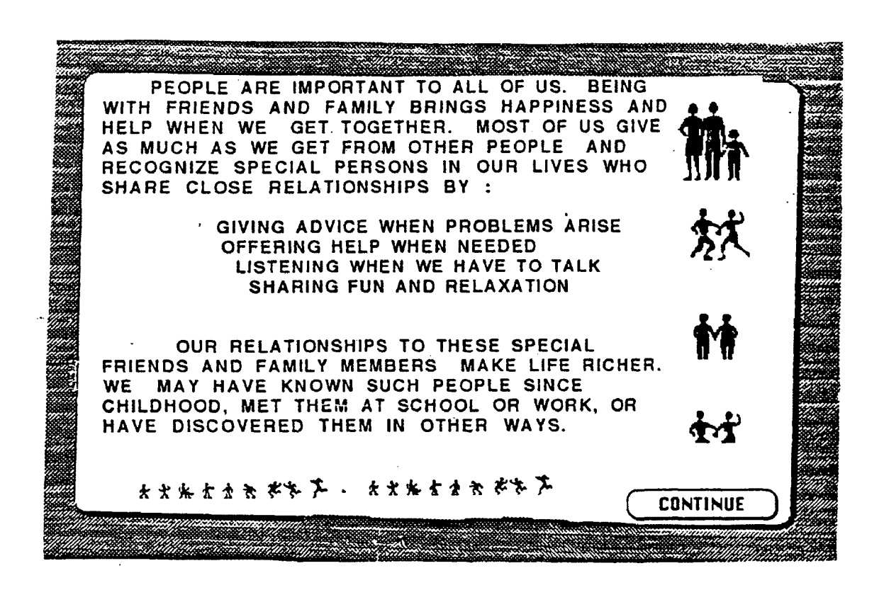
Figure 1. The name generator used in the MSSI. This sort of response generator tends to access the personal social support network, that smaller group of persons closest to the subject.