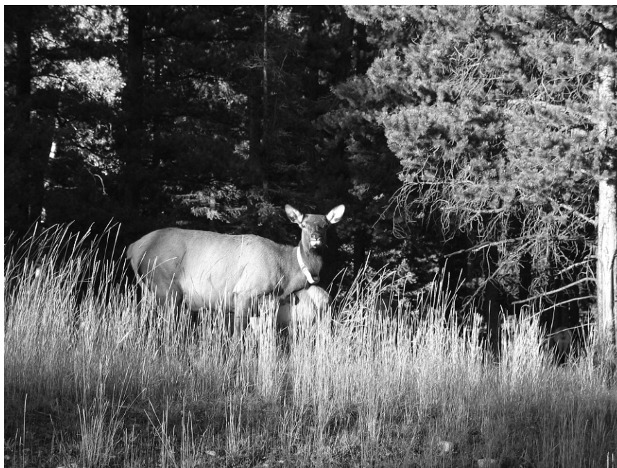
PLATE 1. Migrant and resident elk make trade-offs between risk and forage at different spatial scales. This radio-collared resident elk remained on the winter range during summer, forgoing benefits of migration to high-forage-quality migratory summer ranges but avoided predation by selecting areas close to high human use where wolves avoided humans.

advanced phenology of low-elevation summer ranges. However, avoidance of risky areas undoubtedly exacerbated the overall poorer forage quality of residents, and probably contributed to why resident elk had lower pregnancy rates than migrants (resident = 0.83, n = 63 , migrant = 0.90, n = 78 , P = 0.02 ) and reduced calf body mass (resident = 97.3 kg, n = 11 , migrant = 117.9 kg, P < 0.0001 ; see Hebblewhite [2006] for details). Environmental stochasticity in forage quality may therefore leave residents especially vulnerable. The next step is to directly link resource selection and resulting forage and predation exposure by residents and migrants to demographic differences, the true measure of the consequences of resource selection.