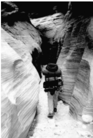
Figure 1—Backpacker entering Buckskin Gulch in the Paria Canyon–Vermilion Cliffs Wilderness; managed by the Bureau of Land management (AZ and UT).

permeate the call for primitive experiences. Wilderness is a sanctuary from modern, technological society. It is a place to reflect, to rejuvenate, and to rediscover ourselves free from the demands and distractions of where we live and work. Wilderness is a contrast and a reminder of how things once were. Two particular eras and lifestyles of American history are also valorized: (1) the simple, close-to-nature lifestyle of indigenous peoples—the “noble savages”; and (2) the virtuous character traits of early European settlers—the “virile pioneers” (Henberg 1994).