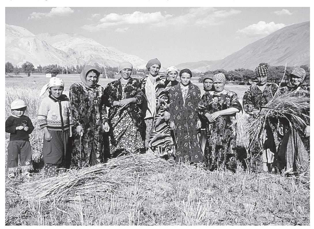
FIGURE 3 If empowered and informed, Muslim women in Tajikistan as well as elsewhere in mountainous Central Asia can play a key role in helping to redress the erosion of seismic culture.

that the Kashmir Earthquake occurred because, as many put it, "it was God's will" and "God's will and destiny chooses who survives and what places get destroyed." There was also a disturbing campaign alleging that one of the reasons for the Kashmir Earthquake was women's sins, inappropriate behavior, and dress. The lack of sound information can lead to blaming these types of events on metaphysical phenomena or social groups rather than focusing attention on the physical hazard, preparedness, and planning. When asked from where they received information regarding relief and reconstruction, the majority of respondents indicated that they had no place to go to collect such information. Nevertheless, tremendous concern exists with regard to the safety of structures and communities in the future. One 30-year-old male teacher in a local school put it this way, "this area is not safe. People are tense and tremors make people worry. Areas should be planned to be safer."