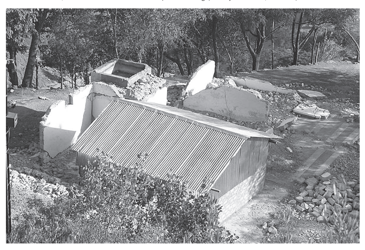
FIGURE 2 The government recommended-rebuilding scheme incorporates the use of a wood frame with 90–120 centimeters of brick or concrete on the lower walls and corrugated galvanized iron (CGI) sheets for upper walls and roofs. Among those interviewed in Pakistani administered Kashmir, 80% felt that this was the best technique for rebuilding.

maintenance, and transmission of seismic culture. Our research suggests that hazard-related information is typically held and shared by elders and passed on orally to younger generations. One Kashmir Earthquake survivor commented, "children didn't previously, but now they ask why the earthquake happened so we [the teachers] talk about it." Yet, the trends in migration, human movement, and social change (Olimova and Olimov 2007) imply the uprooting and relocation of younger segments of the population with an overall erosive effect on cultural adaptations to seismic exposure.