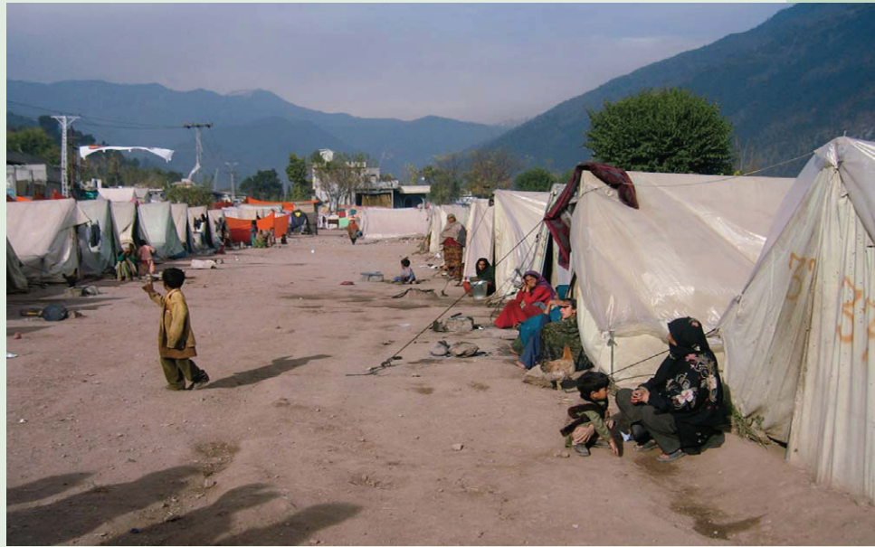
FIGURE 2 An emergency tent village on the outskirts of Balakot provides little privacy and personal space for women. (Photo by J.P. Hamilton, November 2005)

The reality of families and villages being partially or completely buried by rubble and landslide debris overwhelmed the physical and psychological capacity of traditional social-support systems. The surviving women and their families experienced dramatic reductions in food, fuel,