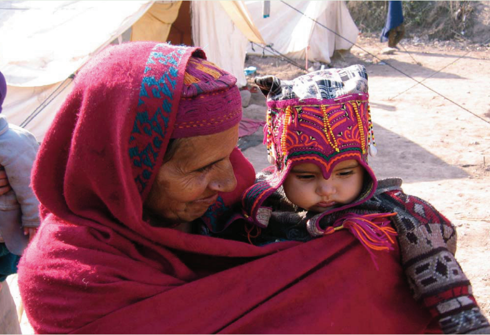
FIGURE 3 Women in tent camps, such as the elderly woman pictured here, took on the roles of surrogate mothers and childcare providers for mothers who had been injured or died as a result of the earthquake. (Photo by J.P. Hamilton, June 2006)

first responders caring for the injured and the dying (Figure 3).