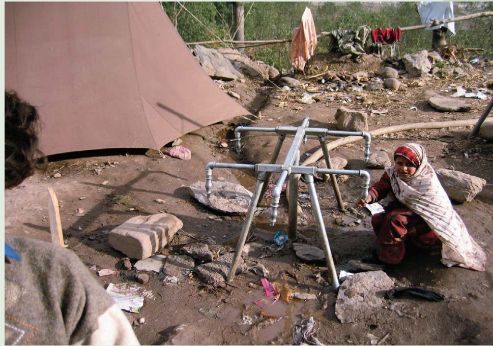
FIGURE 4 Limited access to potable water, inadequate sanitation facilities, and dismal environmental health conditions are challenges women face in caring for their families in the tent villages. (Photograph by J.P. Hamilton, November 2005)

As the quotation from a local woman indicates (see margin), people have demonstrated an amazing amount of resilience and optimism despite the devastation and personal tragedy. Local examples of the ways in which women’s status and gender inequality have been challenged stand out as small victories for some. New centers were established to give women the