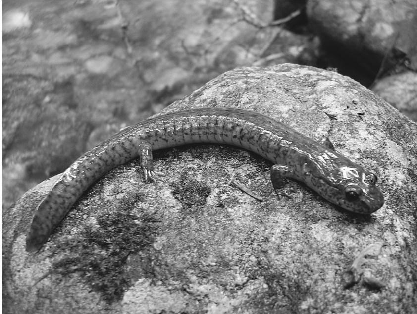
PLATE 1. The spring salamander, Gyrinophilus porphyriticus (Green), a headwater specialist found along the Appalachian uplift of eastern North America.

model in the candidate set was then estimated with AIC c weights (Buckland et al. 1997).