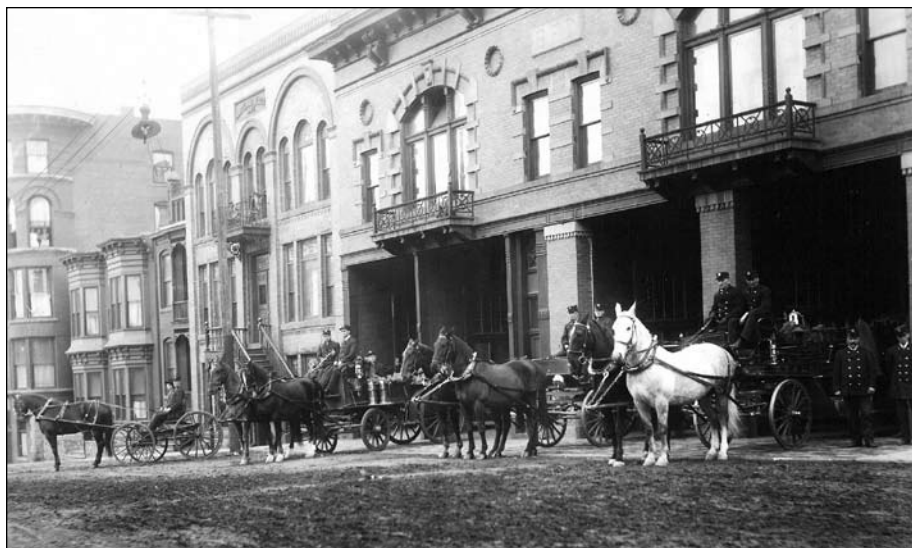
Butte Fire House No. 1, ca. 1900.

Works even asked for Crain's budget and sought to have the archives' building destroyed to provide additional parking for equipment.