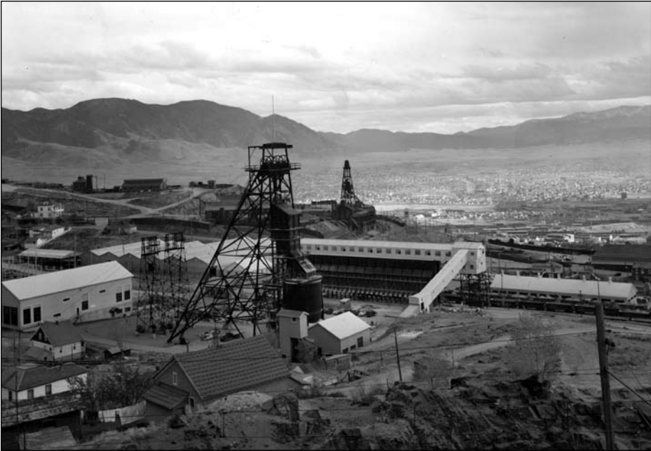
View of Butte's Kelley Mine, ca. 1950.

declared a National Historic Landmark in 1961 and its culture lives on in its 34,000 residents, many of whose families have been in Butte for generations.