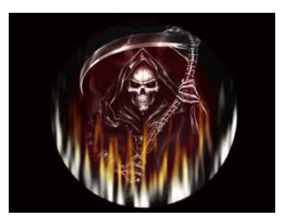
FINAL PRACTICAL EXAM (BLACK BOX)

This examination is a learning opportunity imbedded within the Internship course, CULA 298.