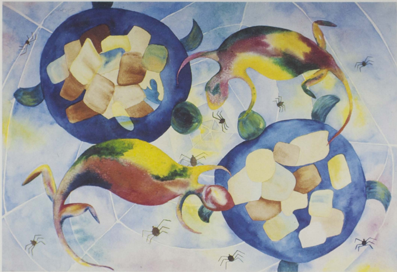
Jenny LaPier Power of the Spider watercolor, 30" x 22" 1993