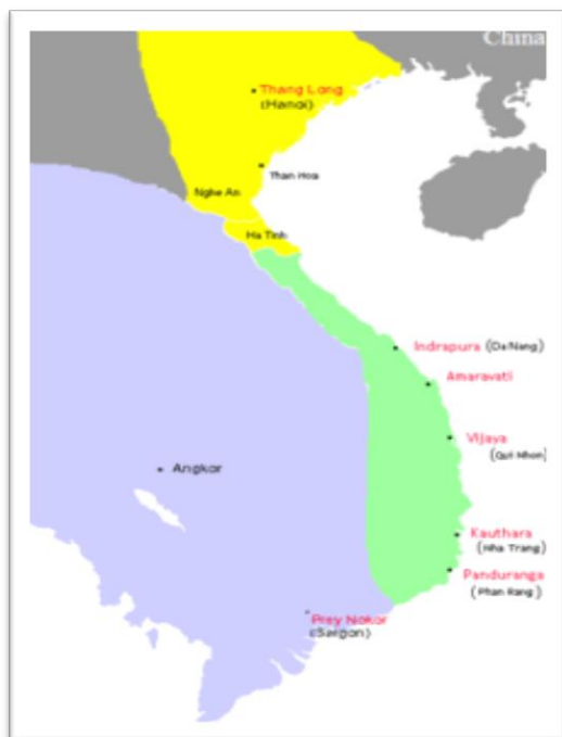
Map 1: Historical extent of the Kingdom of Champa (in green) around 1100 CE.

Key words: ASEAN Community, Cham Muslims, Hindu Chams, Mekong Delta, Regional Integration