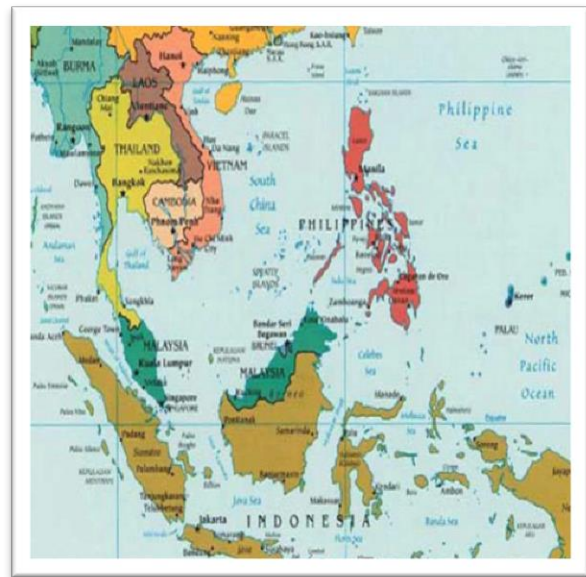
Map 3: Map of Borneo in the ASEAN region