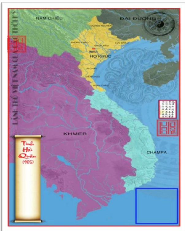
Map 4: Map of Kingdom of Champa (light blue) in 980, Kingdom of Đại Cồ Việt (Yellow) and Khmer empire (purple)