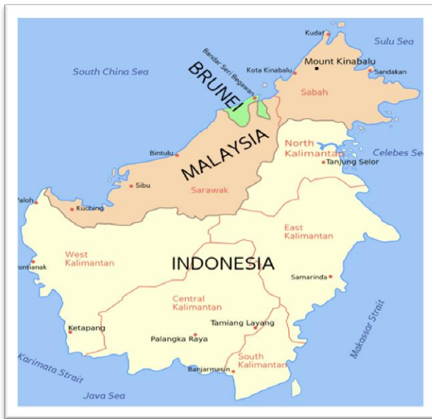
Map 2: Map of Borneo