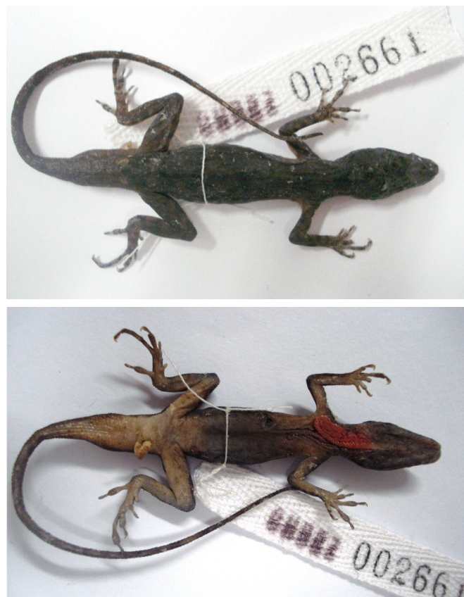
FIGURE 1. Anolis fuscoauratus , juvenile male from Tibau do Sul, Brazil (CHBEZ 2661).

This is the first record of A. fuscoauratus for the state of Rio Grande do Norte, extending the species distribution range ca. 170 km northwestern from Cabedelo, state of Paraíba (Freire 1996) (Figure 2).