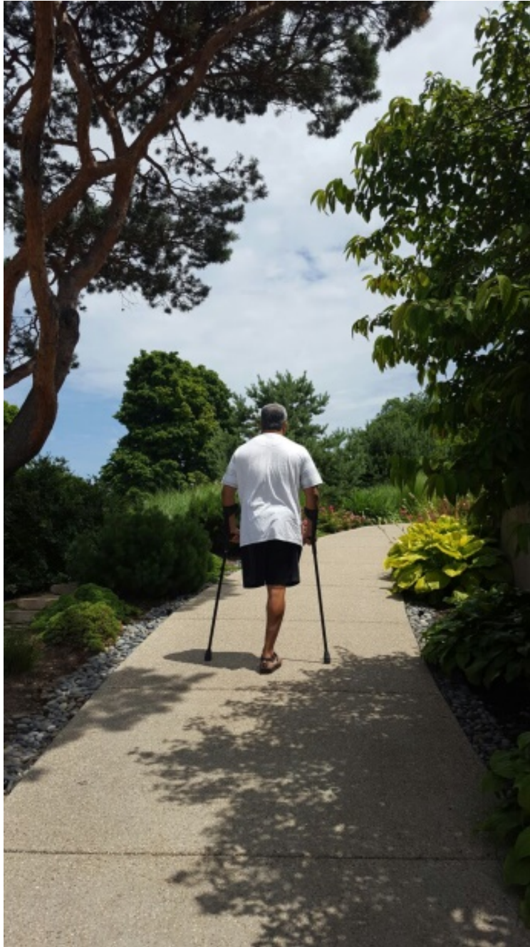
Figure 2. The journey may be arduous but never give up. (P2)