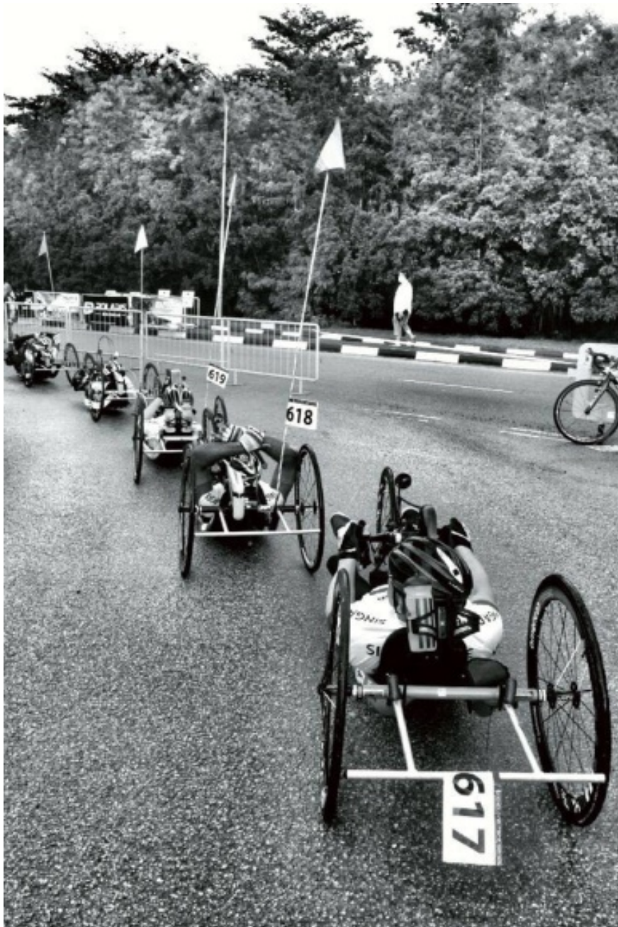
Figure 6. Belonging to a community of cyclists. (P5)