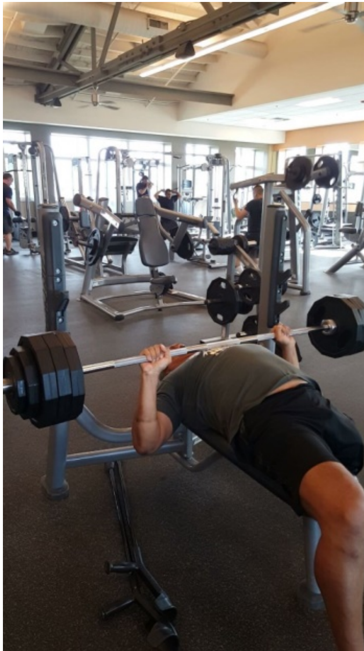
Figure 5. Always training, always working, just like any other athlete. (P2)