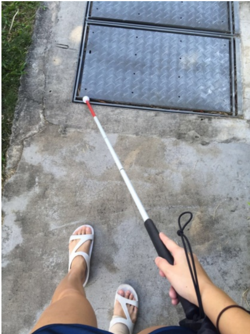
Figure 4. The cane may be part of me but it should not define me. (P3)