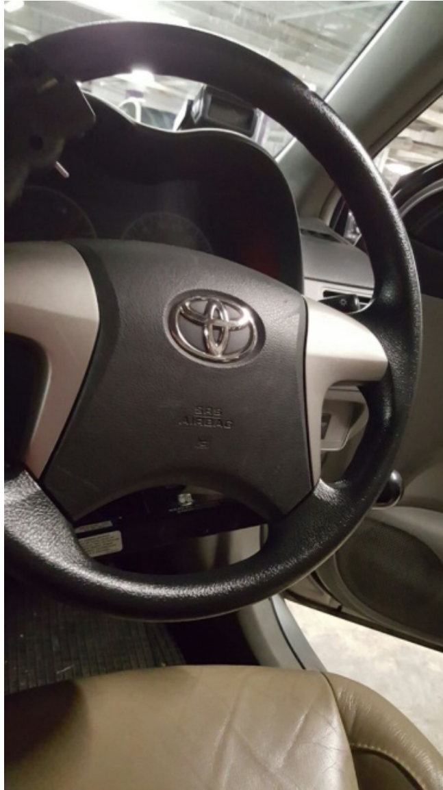
Figure 1. Just because I can't walk, it does not mean I can't drive. (P4)