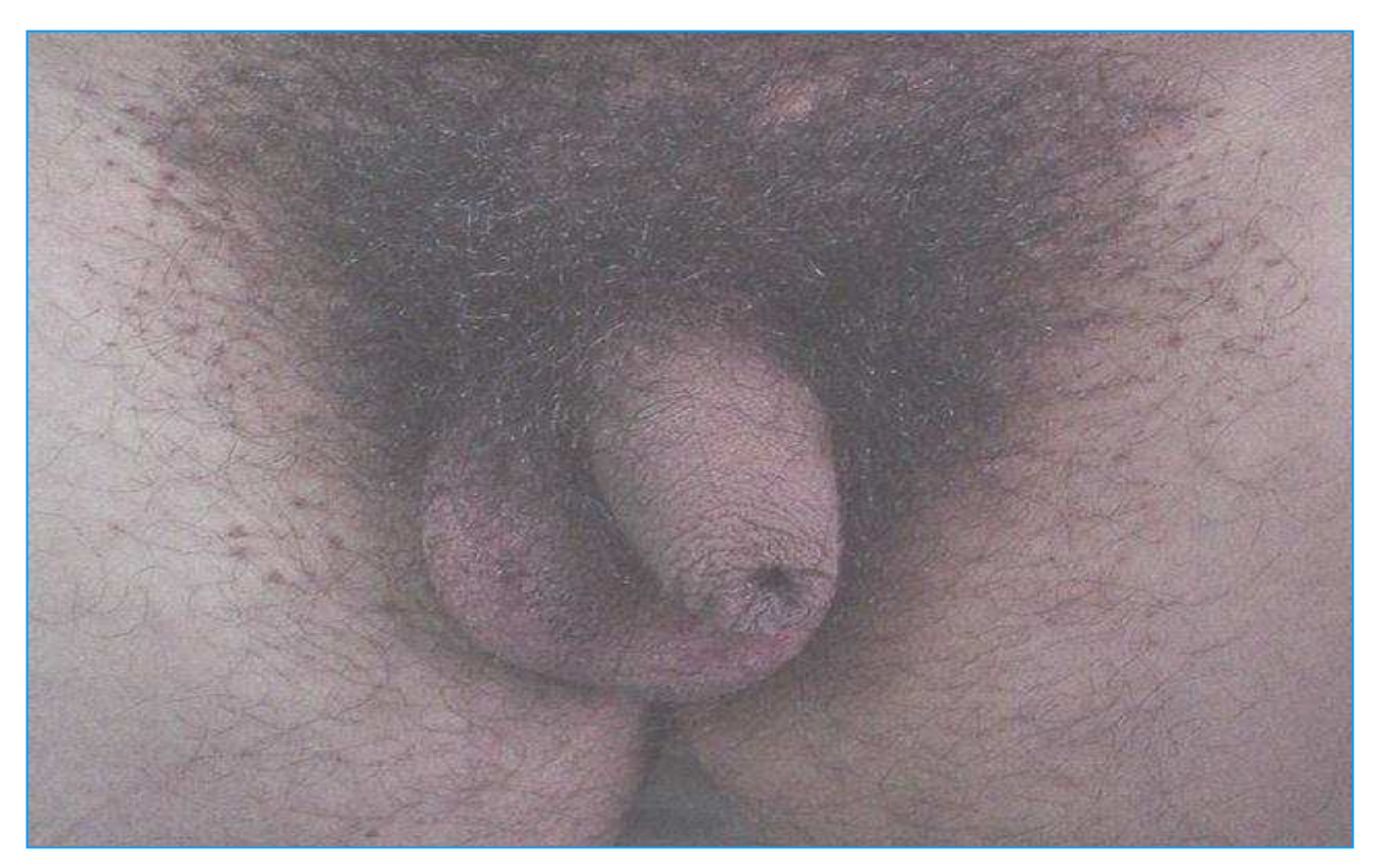
Figure 1. Aspect of hair infection and hematic crust on groins

Treatment is based on head lice or nits destruction benzyl benzoate 25% 8 to 12 hrs once, crotramiton 10% 1 / day x 8 days and ivermectin 200 micrograms / kg in a single dose.