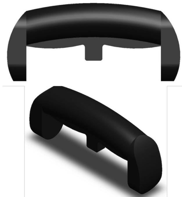
Fig. 1. Three-dimensional rendered image of the handle.

beyond the palm of 95% of the male population (upper limit 114 mm). The additional length allows for the thumb to be placed along the shaft if required. The phalanges, at both ends, encase the fingers, preventing the tool from being dropped, even if the handle is held loosely. The width and length of the phalanges (30 mm \times 60 mm) enables them to accommodate 95% of the male population (upper width limit 216 mm). The cross-section of the handle is rectangular with rounded ends (radius of curvature 30 mm). A rectangular section (width 10 mm and curved with a radius of curvature of 110 mm) enables the handle to accommodate different finger lengths and hand sizes. The combination of circular and rectangular cross-sections is intended to provide comfort and good purchase when the handle is grasped.