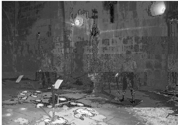
Figure 10.5: Portuguese Tomb of the Unknown Soldier

Other monuments commemorate persons present at the battle they mark. Individual monuments may commemorate the death of individuals, such as that at Roliça in Portugal, in memory of Colonel Lake who fell in battle there in 1808. Groups may equally be remembered, such as the large numbers of mercenaries who died at in the battle of Stoke Field (1487) and marked by the stone in the nearby churchyard. Similarly, those who were present may be recalled, as for the Irish who fought for France at Fontenoy (1745) or those who fought for the allies at Corunna (1809). Alternatively, the presence of a prominent individual may be marked, such as by the obelisk raised to King Louis XV of France, not on the battlefield of Fontenoy (1745) but at Cysoing, some two kilometres away, where he spent the nights before and after the conflict. All of these persons have of course gone: all are now deceased, and no visible evidence remains of them at the place where they are commemorated.