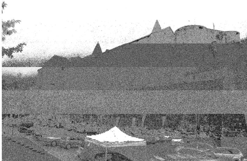
Figure 10.1: Sedan Fortress, France

There is perhaps no more tangible heritage object than the castle of brick or stone. Castles are a widespread type of structure: they are found all over the world, built of all kinds of materials. They generally fall within the category of “heritage” because few cultures build or use castles any more and they have an abundant capacity for survival: they tend to be fairly robust structures.