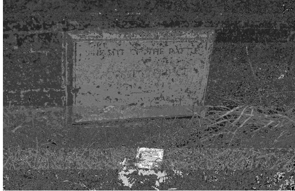
Figure 10.4: Memorial at Cropredy Bridge

“comrades” of three hundred years previously. This process—of placing the tablet, of re-enactment, of leaving tributes in remembrance—represents the reversal of the normal process of preserving objects from the past to represent intangible qualities. Here, instead, the intangible is represented by the creation of new objects.