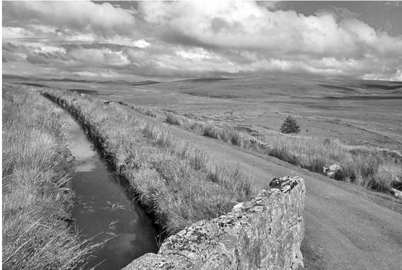
Figure 10.3: Whiteworks

Heritage is therefore inevitably a realm of ideas rather than a collection of things. Any object can become a heritage object: it has nothing to do with the physical attributes of the object, but rather what we hold to be important about it. This is the same point that Cornelius Holtorf and Tim Schadla-Hall (2000) have made regarding “aura” and “authenticity”, that what we think about objects depends upon the contemporary context: the “authentic replica” or “authentic reproduction” can really exist and can be valued as much—and sometimes more—than an “authentic original”. An object does not have to be old—or even pretend to be—to be granted “heritage” status; and it does not have to be really what it purports to be: fictional objects can be granted it too.