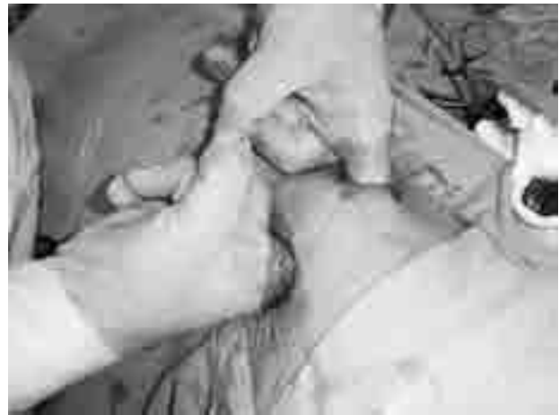
Figure 1. Operative image of the bilateral finger assisted laparoscopic renal cyst excision.

Following CO 2 insufflation, a 10-mm trocar was inserted in the first incision and 30° telescope was placed through this trocar. The other trocars