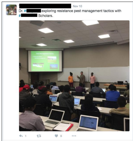
Figure 2. Screen capture of Trisha’s visual class presentation tweet.

Visuals appeared to be a driving force in many of the scientists’ tweets. Scientists often posted a photo from their classes or conferences they attended. For instance, Trisha shared photos of class presentations from an international program (Figure 2).