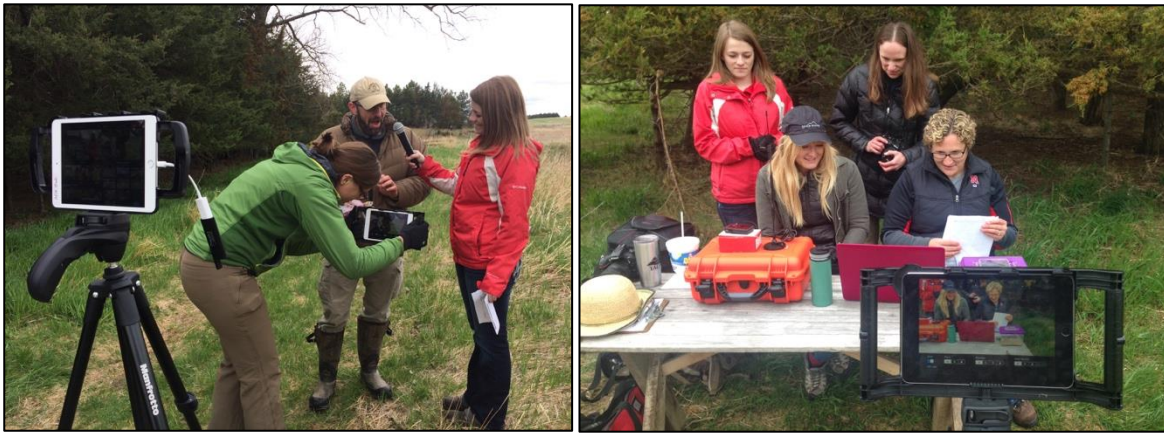
Figure 3. Behind the scenes photos of crew members and SMEs operating iPads and reviewing student submitted questions for the ‘Streaming Science: Ranches, Rivers, and Rats’ 2017 EFT from Calamus Outfitters in the Nebraska Sandhills.