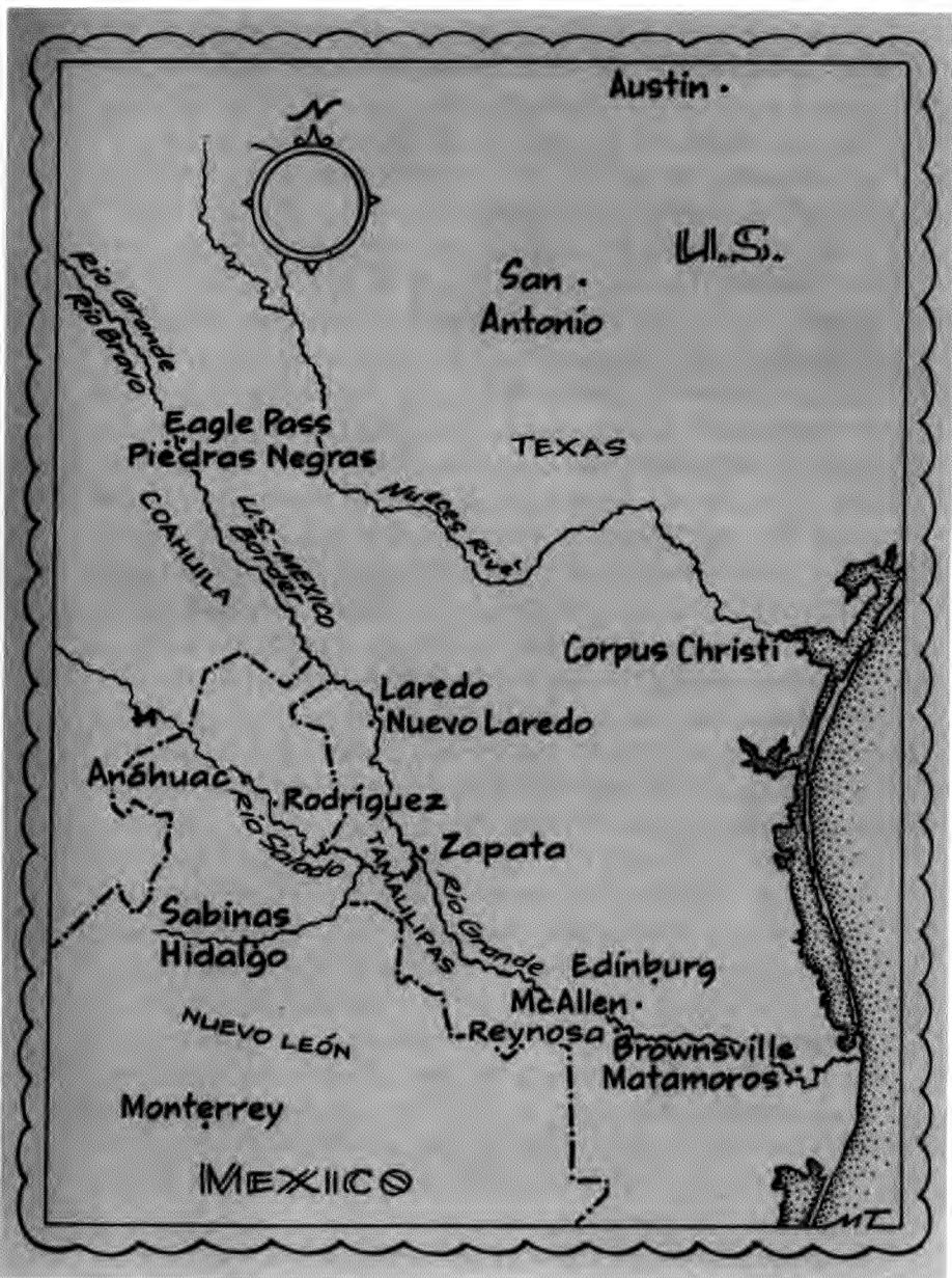
Fig. 1. Map, Cancicula , p. x. Published by New Prairie Press