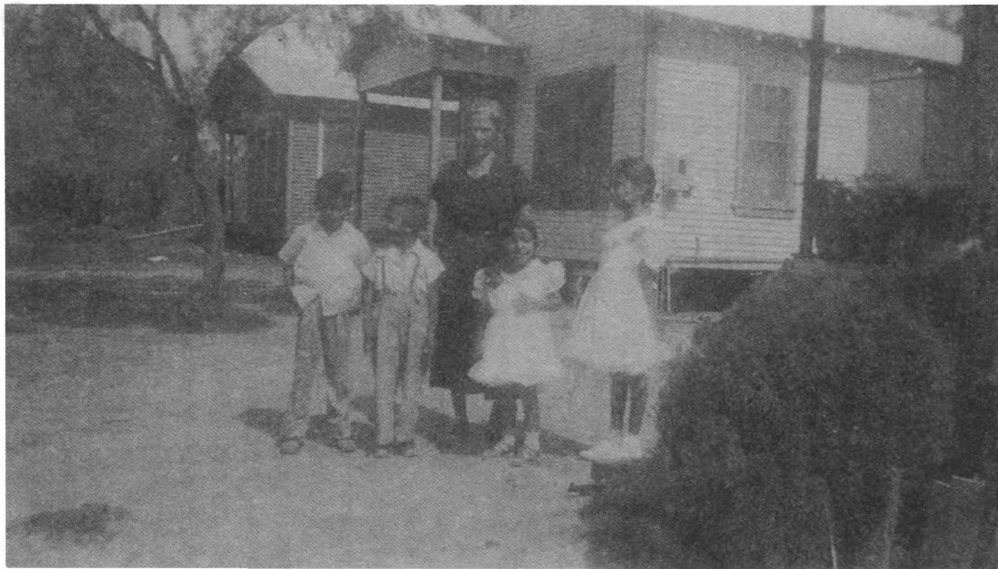
Fig. 2. Family photograph, Canícula , p. 4.