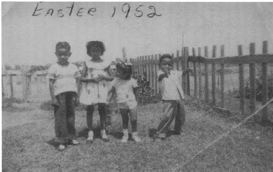
Fig. 5. Family photo, Canícula , p. 14.