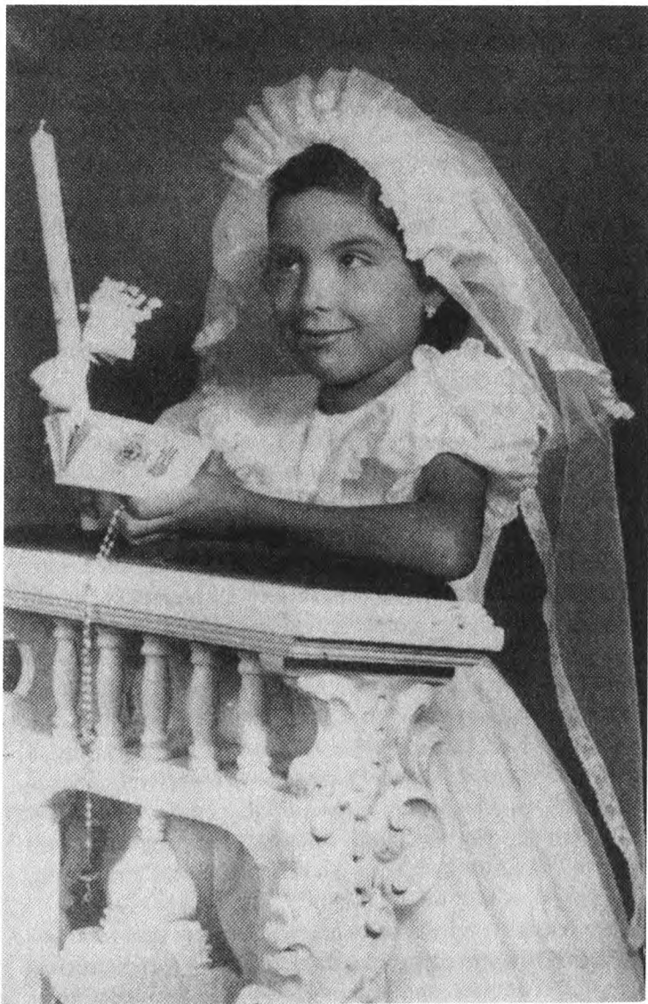
Fig. 7. First communion photo, Canícula , p. 56.