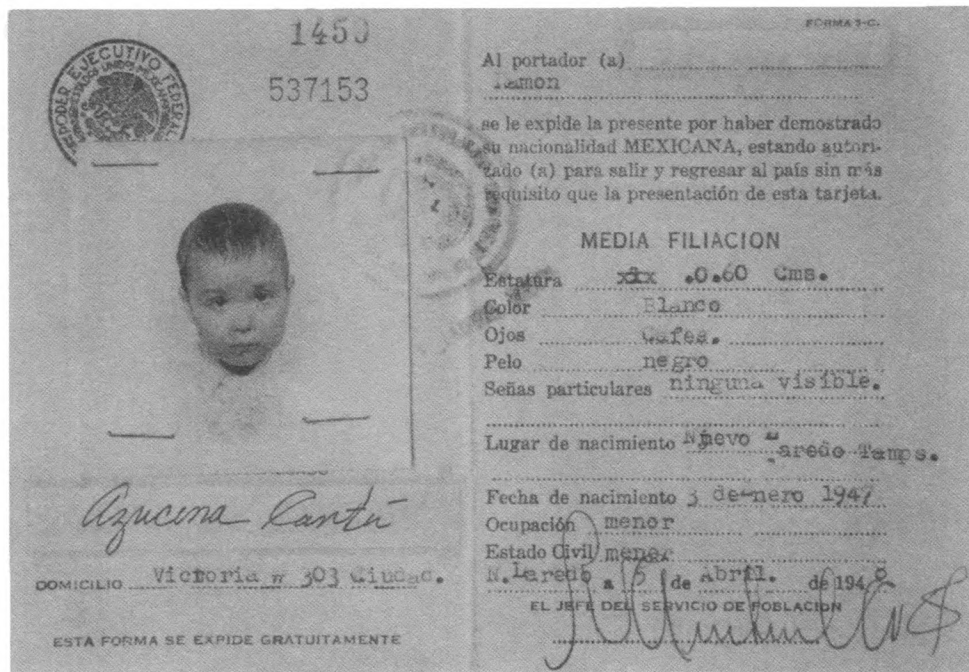
Fig. 3. Photo of U.S. immigration papers, Canícula , p. 21.