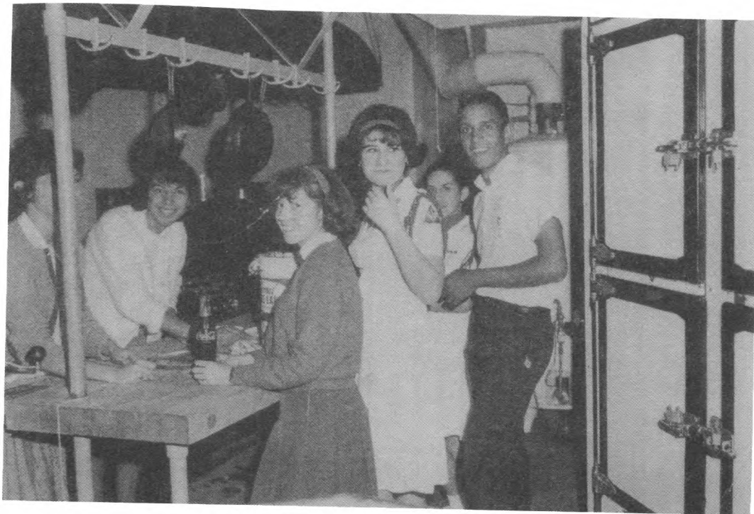
Fig. 6. High school photo, Canícula , p. 130.