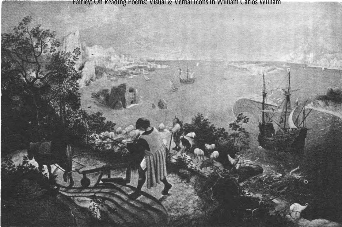
Landscape With The Fall of Icarus . Reproduced with permission of the Musées Royaux. Musées Royaux des Beaux-Arts de Belgique, Brussels.