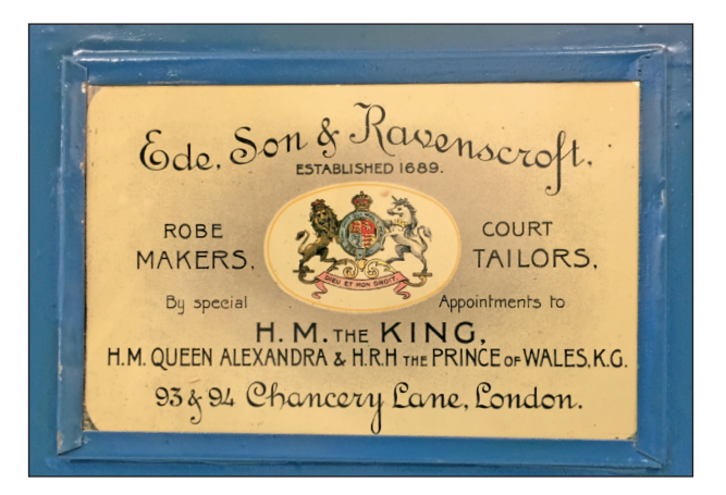
FIG. 2 Ede, Son & Ravenscroft label on case for 1909 Birmingham LLD of Sir Charles Tomes, at the Science Museum, London. It is one of three label styles on the kit made for Charles S. Tomes.