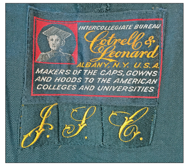
FIG. 8 The label in a Cotrell & Leonard bachelor's gown, c. 1900, includes a portrait of woman.

FIG. 7 Cotrell & Leonard newspaper advertisement in the Columbia Spectator , 20 Nov. 1890, p. vii, also depicts a woman in cap and gown.