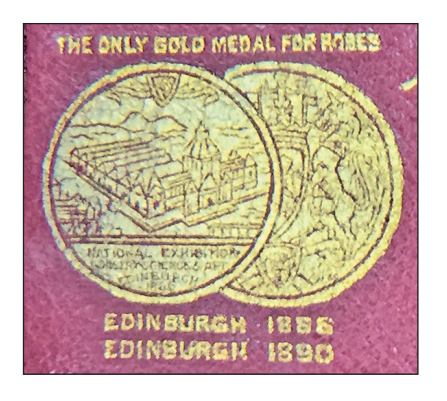
FIG. 5A Detail: 'The Only Gold Medal for Robes' from the 1886, 1890 International Exhibition of Science, Industry and Art, in Edinburgh.

For decades, large European and American cities had been hosting fairs to promote consumer goods and manufacturing advances at what were essentially trade shows that were dressed up to appeal to visitors regardless of their interest in production efficiency. In 1886, three other exhibitions drew crowds to demonstrations of international shipping, in Liverpool; colonial and Indian trade, in London; and art, in Folkestone. If you notice a certain tendency in geographic locations, you are not alone. Of the forty-seven exhibitions around the world from 1880 to 1886, eighteen were held in England with all but two of those in London, a list that demonstrates important advances of the day: electric lighting (1880), smoke abatement (1881), fisheries (1883), and inven-