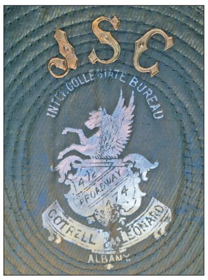
FIG. 8A The cap with the gown in Fig. 8 shows a very different label.

FIG. 9 (Right) The much simplified Cotrell & Leonard label in a PhD gown, c. 1980, of Prof. Doretta Hoffman.