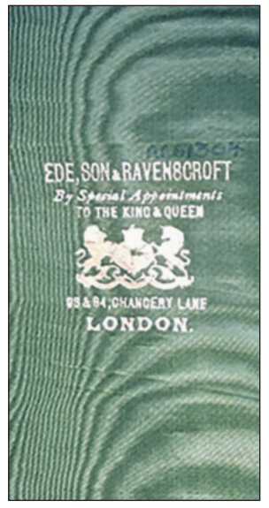
FIG. 2B The watered silk lining of bonnet matches the hood lining and shows a different style of label.

FIG. 2C (Left) The third style of Ede label appears in Tomes' gown.