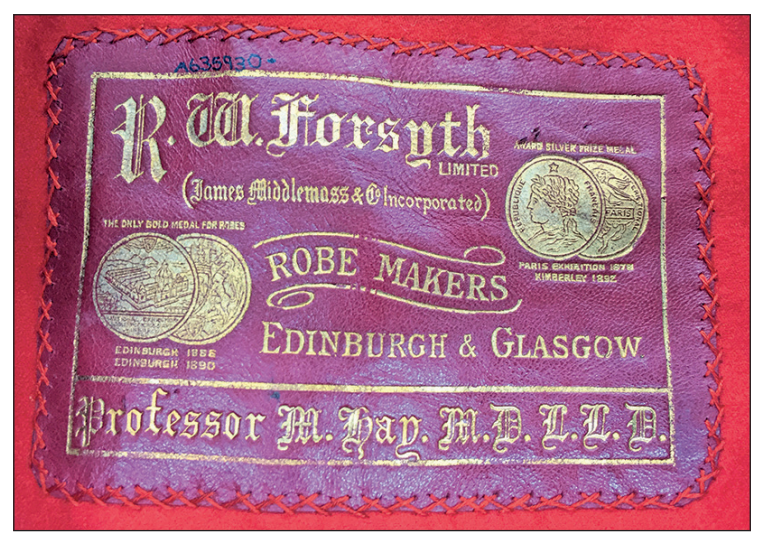
FIG. 5 R. W. Forsyth label in a 1927 Aberdeen LLD gown.

tional rather than merely National, as the label and its reproduced medallions suggest.