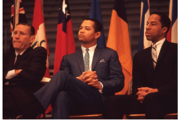
Until recently, the only known photos of King's visit were black and white. These images were found in archives records titled "Photographic Services photographs."