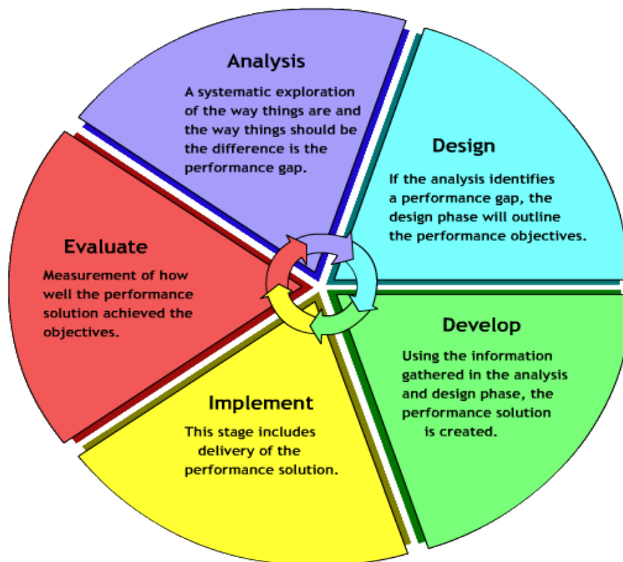
ADDIE Model (Chico State IDTS, n.d.)

Davis (2013) described the first ADDIE phase, analysis, as the step where a blueprint for the course process was determined. The researcher explored as many plagiarism tutorials as could be found, collected information about each, determined course and module goals and objectives, structure, subject of modules, organization and fit for a small Liberal Arts college. This research also helped to determine whether there were any gaps that existed on the topic, based on what the literature on plagiarism suggested. Finally, a tutorial layout was created and a barebones tutorial emerged. The online plagiarism tutorial was created in Blackboard, as a one-credit hour, self-paced tutorial with a built in certificate of completion, triggered, once a student had attained an overall passing grade in the course gradebook. During the second and third phases of the ADDIE model, the design and the development phases, four content modules were completed, consisting of subject-specific tutorials and web links and topical video tutorials. The course itself had overarching goals that were connected to the objectives for each one of the modules.