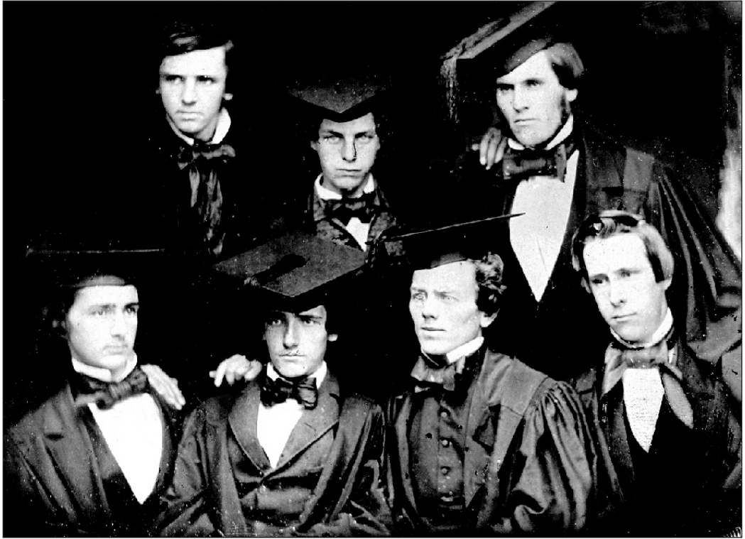
FIG. 1 'Acadia graduating class, 1858'.

tion was less dependable. Joseph Howe, Nova Scotia's best-known political leader in the nineteenth century, supported the ideal of a central, non-sectarian university (i.e. Dalhousie) and condemned the creation of Acadia. Nonetheless, he prophesied its future. In a somewhat rueful 1849 speech to the Legislative Assembly on the issue of the government's financial support for post-secondary education, he said: