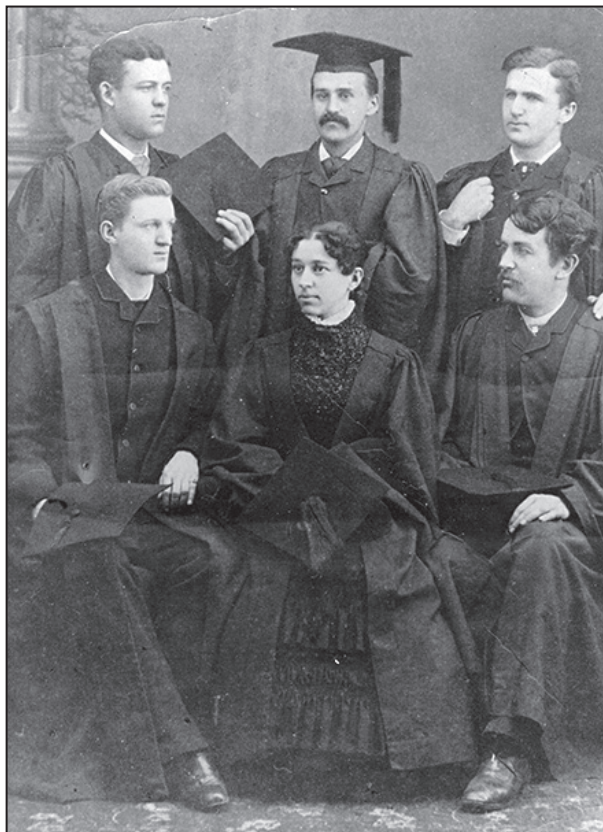
FIG. 2 The first female to graduate from Acadia. 'Acadia graduating class, 1884'.

a plain black gown. A picture of the seven-member graduating class of 1858 (see Fig. 1) shows them all in cap and gown (and bow ties) 21 and in 1878 the Athenaeum noted that the 'opening of College saw the Freshmen assemble. How picturesque they looked in cap and gown.' 22