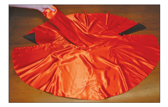
FIG. 7 (RIGHT) Muceta in orange lined black, inverse shown unfolded with cogulla held up inside out.