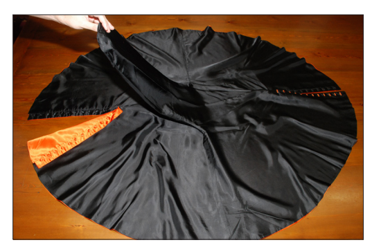
FIG. 5 Muceta in orange lined black, shown unfolded with cogulla held up.