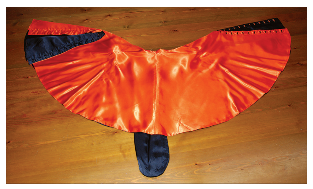
FIG. 4 Muceta in orange lined black, shown folded as worn.