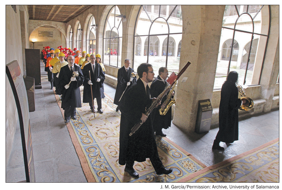
Fig. 1 Academic procession at the Festival of St Thomas Aquinas, University of Salamanca, 2014.