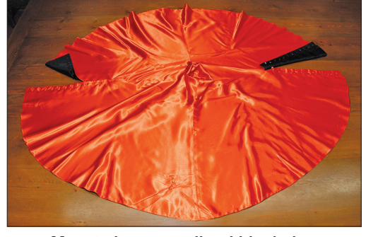
FIG. 6 Muceta in orange lined black, inverse shown unfolded.