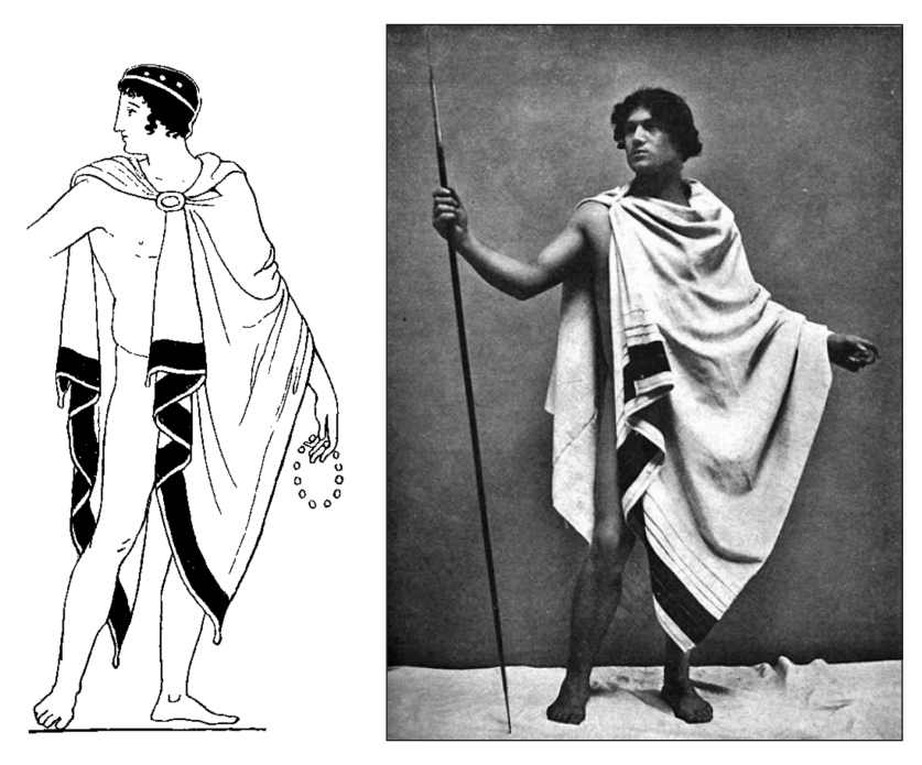
FIGS 1, 2. Two pictures of a chlamys, showing movement of the clasp.

below the pallium . If the higher layer is preferred for the pallium , then a better translation might be 'cloak' or 'mantle'.