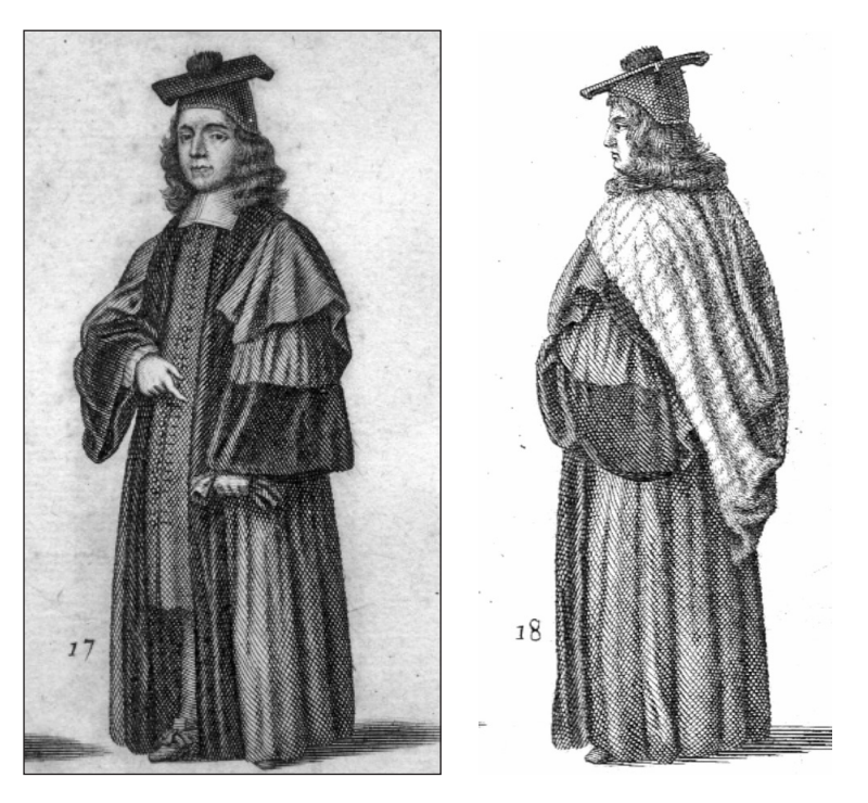
FIGS 3, 4. Oxford Proctors wearing the tippet in 1675.

from which compassion, in accord with [their] purple robes, the scholars themselves shall be able to be reminded inwardly of the passion of Christ, by the evidence of the same love, poverty and humility, having been shown to the view of the eye.