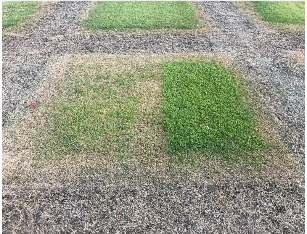
Figure 3. Large patch symptoms in a less susceptible experimental progeny (top center) compared to a susceptible experimental progeny in October 2017 after inoculating in September 2016 in Manhattan, KS.