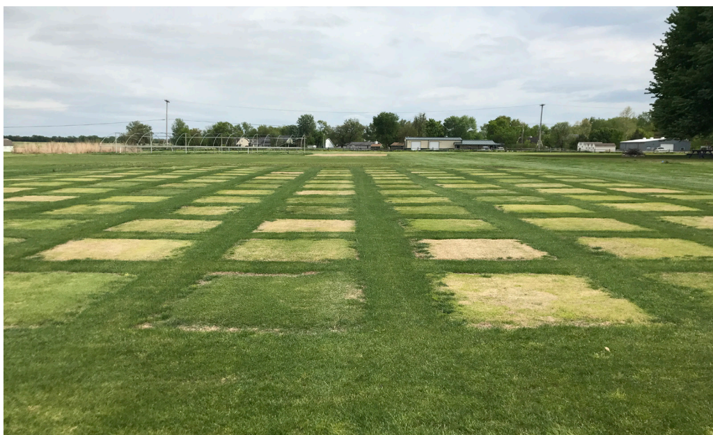
Figure 1. Progeny showed a wide range of variability in spring green up on April 26, 2017, in Manhattan, KS.

§§ Statistical differences occur when this value is larger than the corresponding least significant difference (LSD) value ( P < 0.05 ).