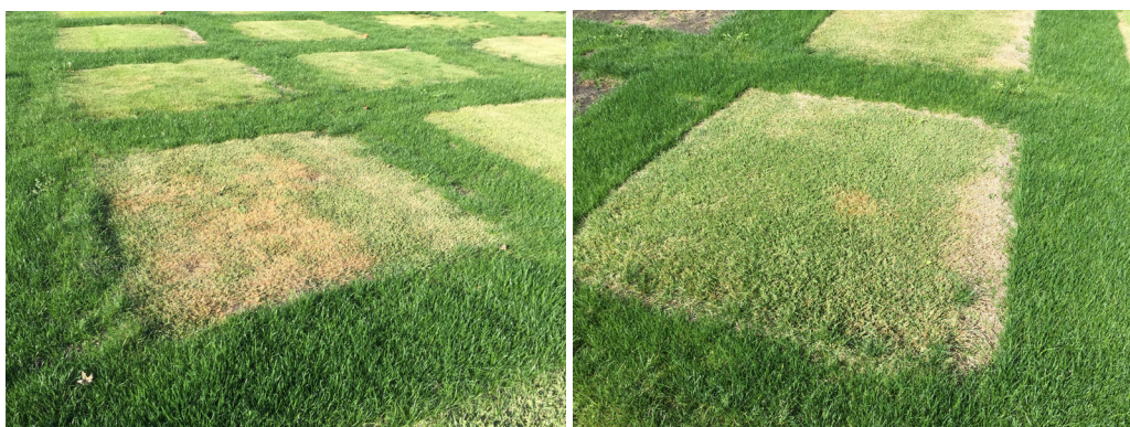
Figure 5. Large patch symptoms in Meyer zoysiagrass (left) compared to an experimental progeny in November 2016 after inoculating in September in Manhattan, KS.