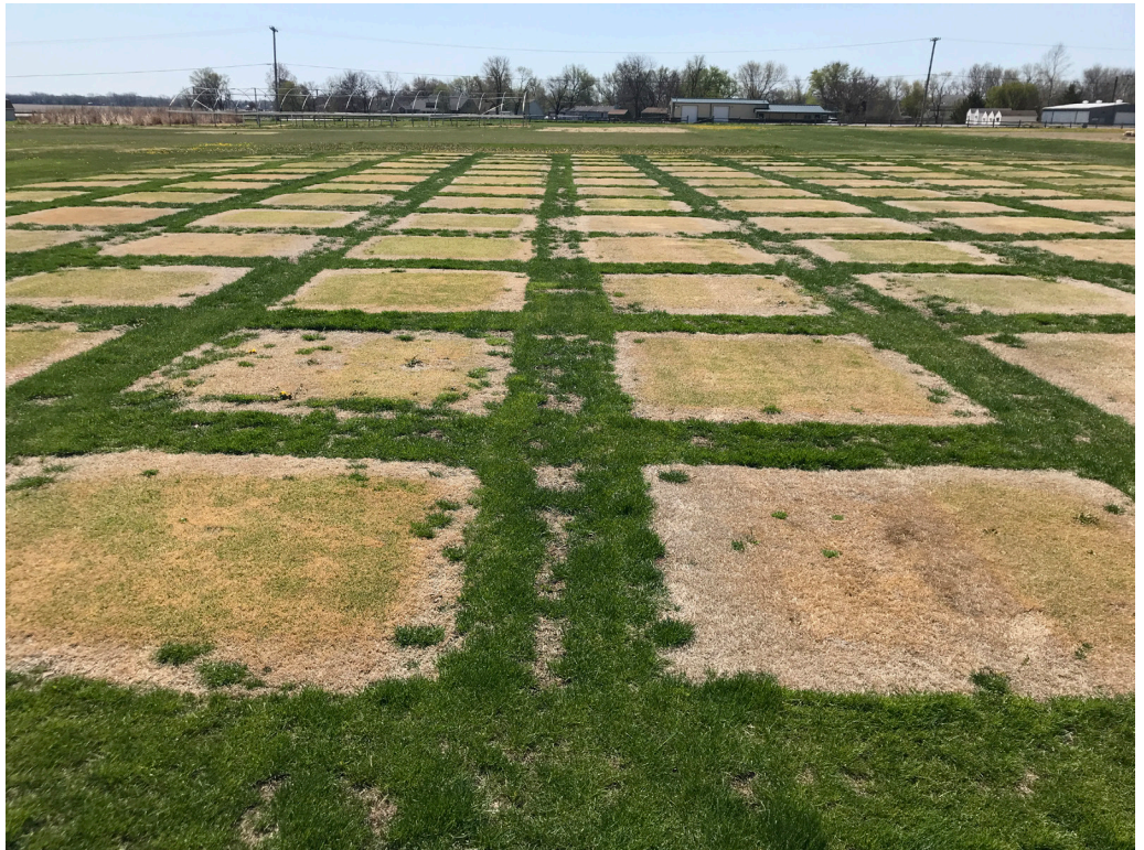
Figure 2. Progeny showed a wide range of variability in spring green up on April 28, 2018, in Manhattan, KS.