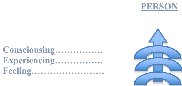
Fig. 1. Model of Person . Graphically adapted by Strohschen.

applied principles of constitutive phenomenology to the process of education of person through “feeling, experiencing, and consciousing” (1987, p. 328), depicted below: