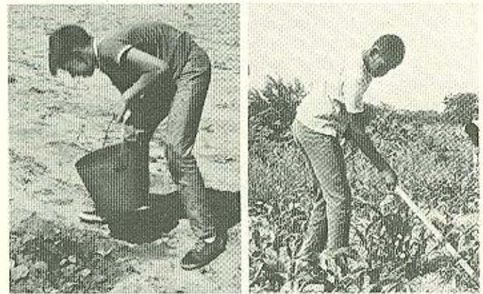
BELOW, RIGHT: Members of the class cultivate their crop of corn—for popcorn—while they cultivate their language.