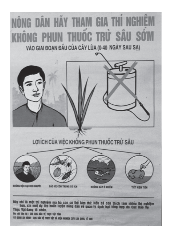
Figure 2. Poster used in campaign in Long An province, Vietnam.