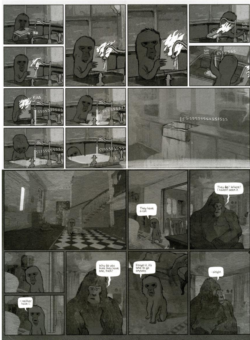
Figure 2: from Duncan the Wonder Dog, Show One , p. 331

To read as a human or, however provisionally, to read as an animal: this would appear to be the choice. At least, so we might think, insofar as we have forgotten the animal who is reading. The diary closes, and in Figure 2, without a word of commentary, Pompeii sets it alight and, after watching it burn for a few moments, douses it in the Johnsons’ kitchen sink, which begins to overflow. Pompeii then walks into the living room where Georgios is keeping watch over John and remarks, “They have a cat.” Georgios asks how Pompeii knows this; she responds, “Forget it, it’s time to go anyway” (331).