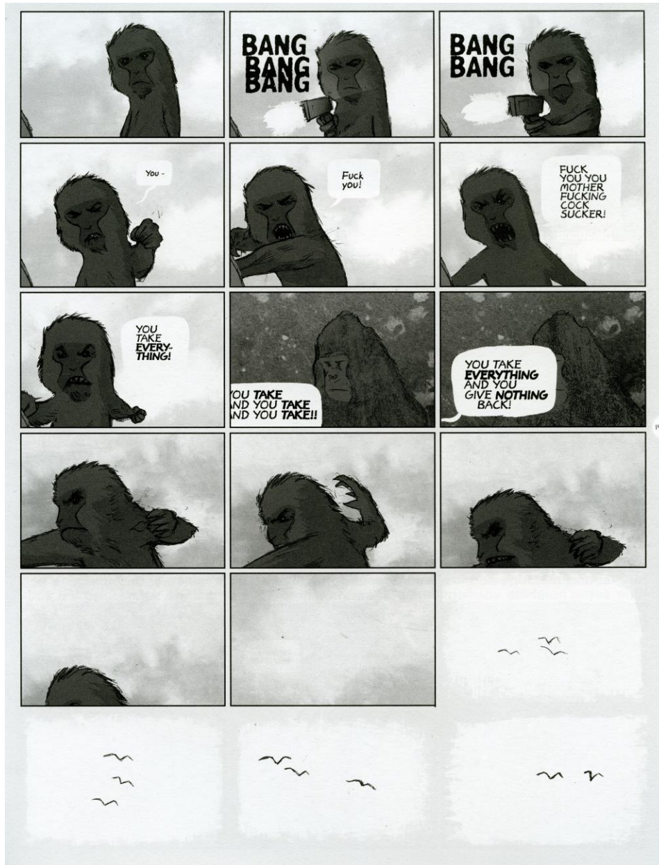
Figure 1: from Duncan the Wonder Dog: Show One , p. 195

On this page, Hines is attempting to make an animal character say things that fictional animals rarely express in the face of contemporary conditions. Counter to a range of well-known types—the lumbering forest guardian who expresses dignified sorrow at environmental destruction, the cuddly herbivore who is panicked and uncomprehending in the face of human predation, and so forth—