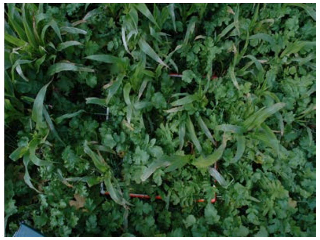
Figure 1. Tillage radish planted after corn harvest; center square is 1 sq. yard.