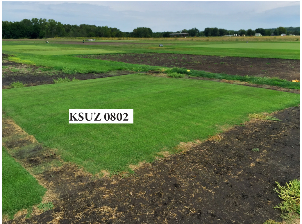
Figure 3. KSUZ 0802 produces turf with Z. matrella -like quality, but cold hardiness equivalent to Meyer.