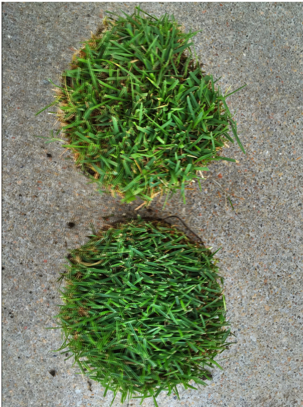
Figure 2. The finer texture and improved density of KSUZ 0802 (bottom) is obvious when compared to Meyer (top).