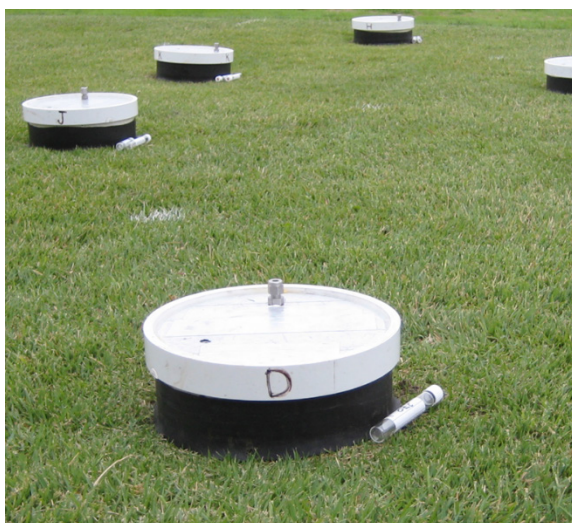
Figure 3. Close-up of one of twelve static chambers used for sampling N_2O .