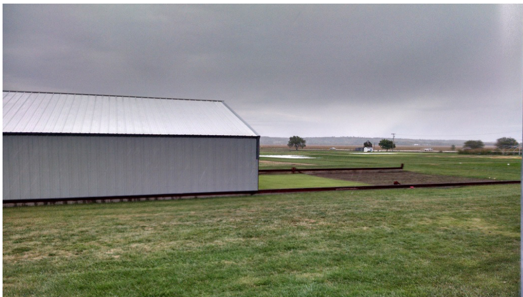
Figure 1. Automated rainout shelter moving across plots activated by 0.01 inch of rain.