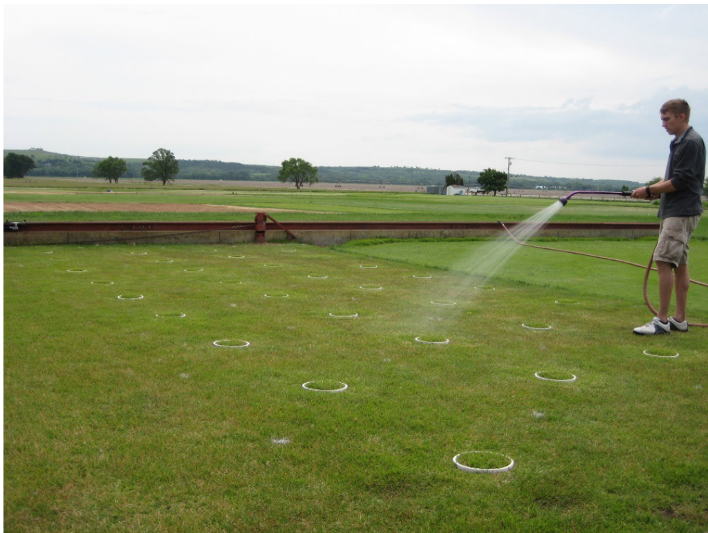
Figure 2. Plots received precise irrigation amounts based on daily ET during summer period.