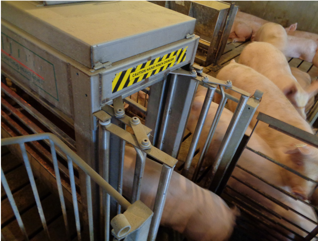
Figure 5. Gate with electronic sensor to the feeding area.