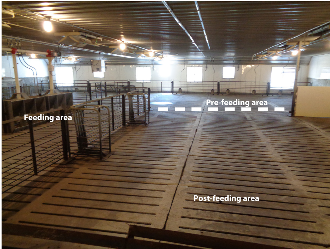
Figure 3. Pre-feeding, feeding, and post-feeding areas.