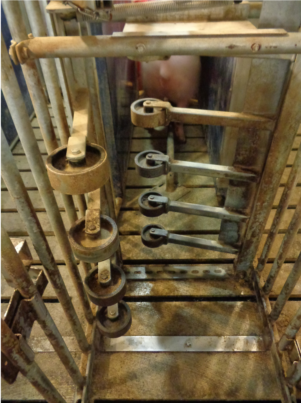
Figure 6. Left entrance gate wide open.