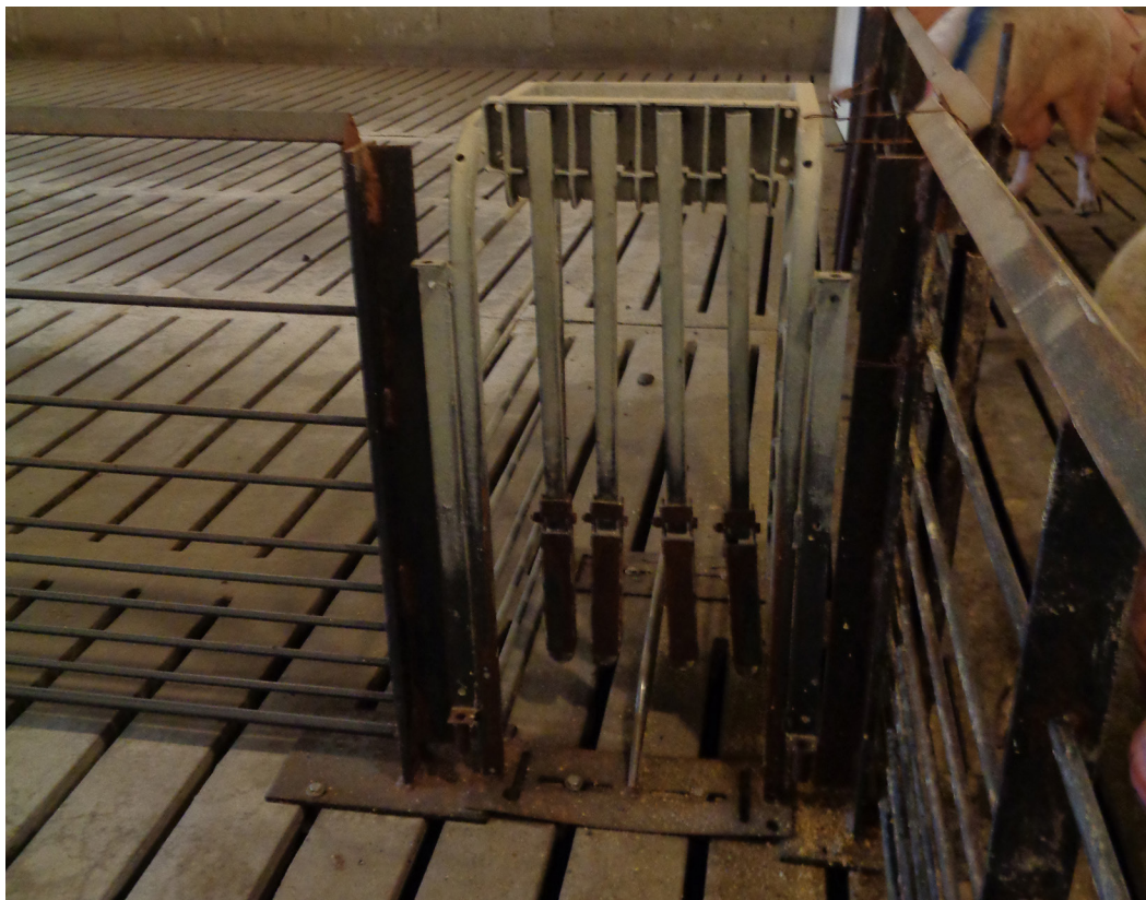
Figure 2. One-way gate with bars suspended vertically.