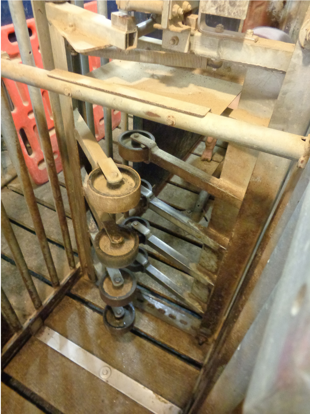
Figure 4. Gate similar to ESF. Left entrance gate open at 45° angle.