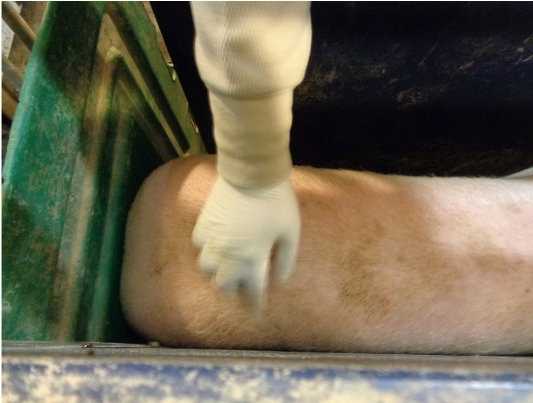
Figure 9. Scratching a gilt to encourage forward movement.