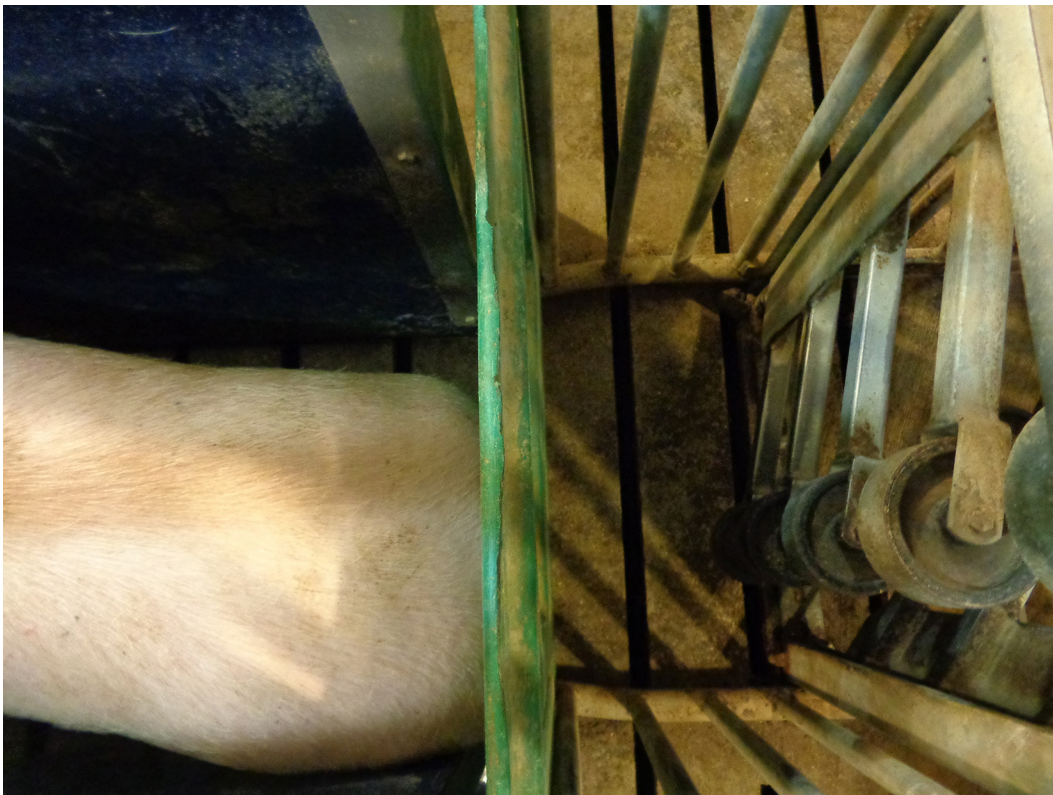
Figure 8. Board to narrow the space to bowl.