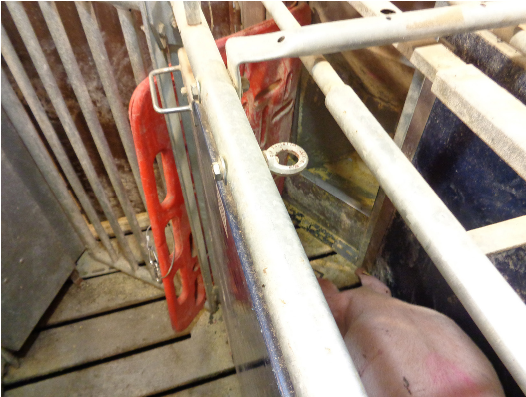
Figure 7. Front board to shut the exit.