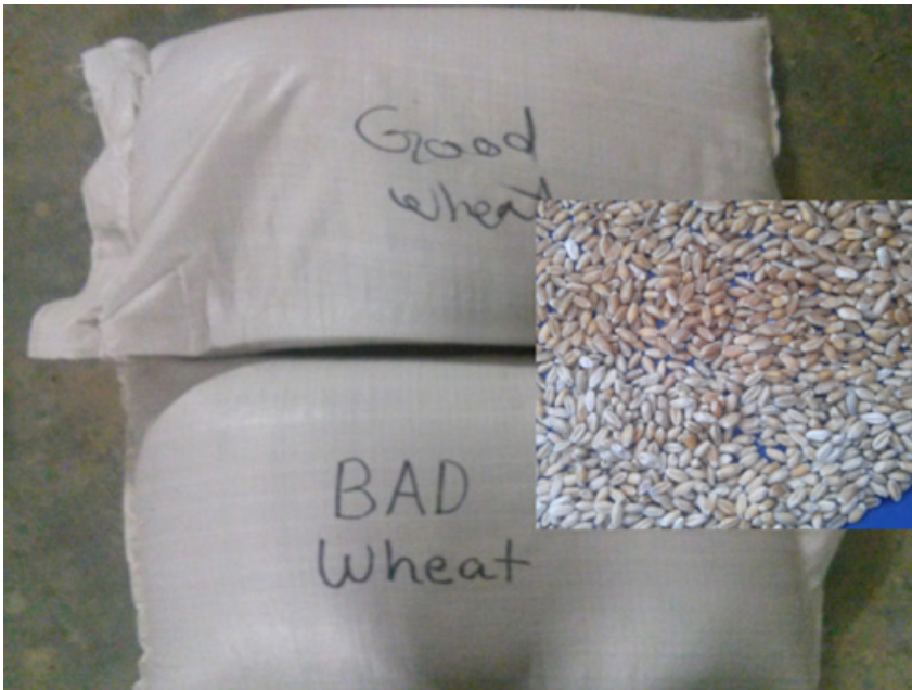
Figure 1. Healthy (“Good”, early-harvested) and infected (“Bad”, late-harvested) wheat seed (cv. Everest) collected from a cooperating farmer. The “Bad” seed had been cleaned several times, but still showed bleaching associated with FHB.

This research is funded in part by a grant from the Kansas Crop Improvement Association.