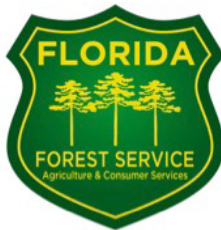
Figure 1. Logo for the Florida Forest Service.