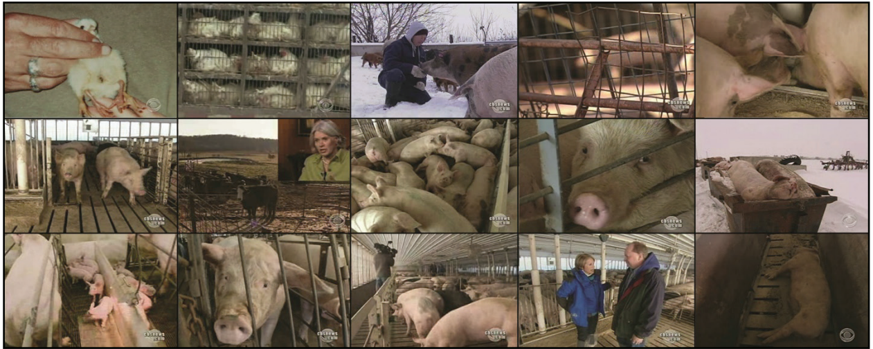
Figure 1. Images taken from broadcast news story on antibiotic use in livestock in the order shown to survey participants (Couric, 2010).

The open-ended responses were content-analyzed by the researchers. Fraenkel and Wallen (2009) define content analysis as “a technique that enables researchers to study human behavior in an indirect way through analysis of their communications” (p. 472). “Content analysis... involves identifying, coding, categorizing, classifying, and labeling the primary patterns in the data” (Patton, 2002, p. 463). Two methods of content analysis identified by Fraenkel and Wallen (2009) were used to describe the data: frequencies and the percentage and proportion of particular occurrences to total occurrences and the use of themes to organize and explicate findings.