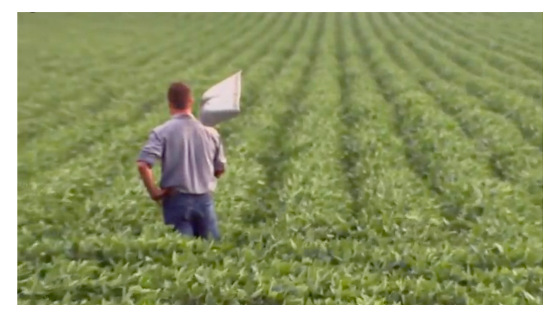
Figure 1 . Chris Soules, standing in a soybean field, looks off into the distance on his family's 6,000-acre farm in the first episode of The Bachelor Season 19.

Specht and Beam: Prince Farming Takes a Wife: Exploring the Use of Agricultural Im