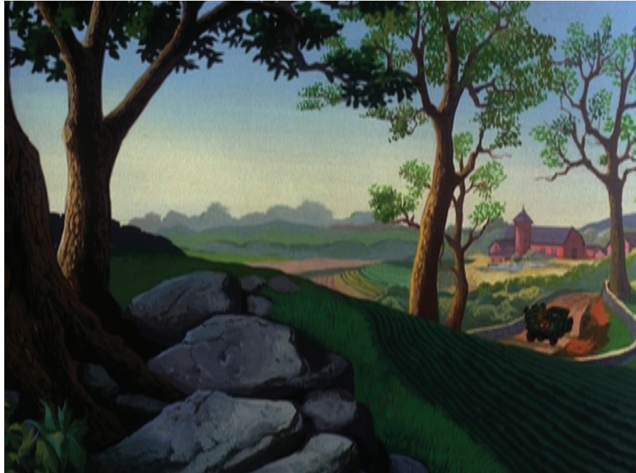
Figure 5. Homer Zuckerman drives through the scenic New England countryside (Barbera, Hanna, Nichols, & Takamoto, 1973).