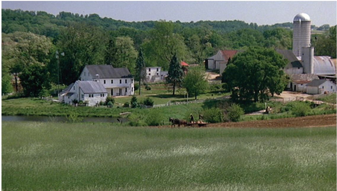
Figure 9. The Lapp farm represents the quintessential agrarian locale (Feldman & Weir, 1985).

travel to a neighboring farm for a barn raising, an Amish celebration of community and hard work.