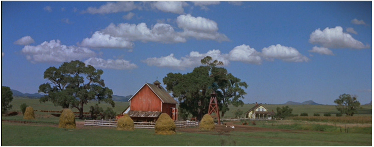
Figure 1. Laurey and Aunt Eller's homestead from the film Oklahoma! (Hornblow, Jr., & Zinneman, 1955).