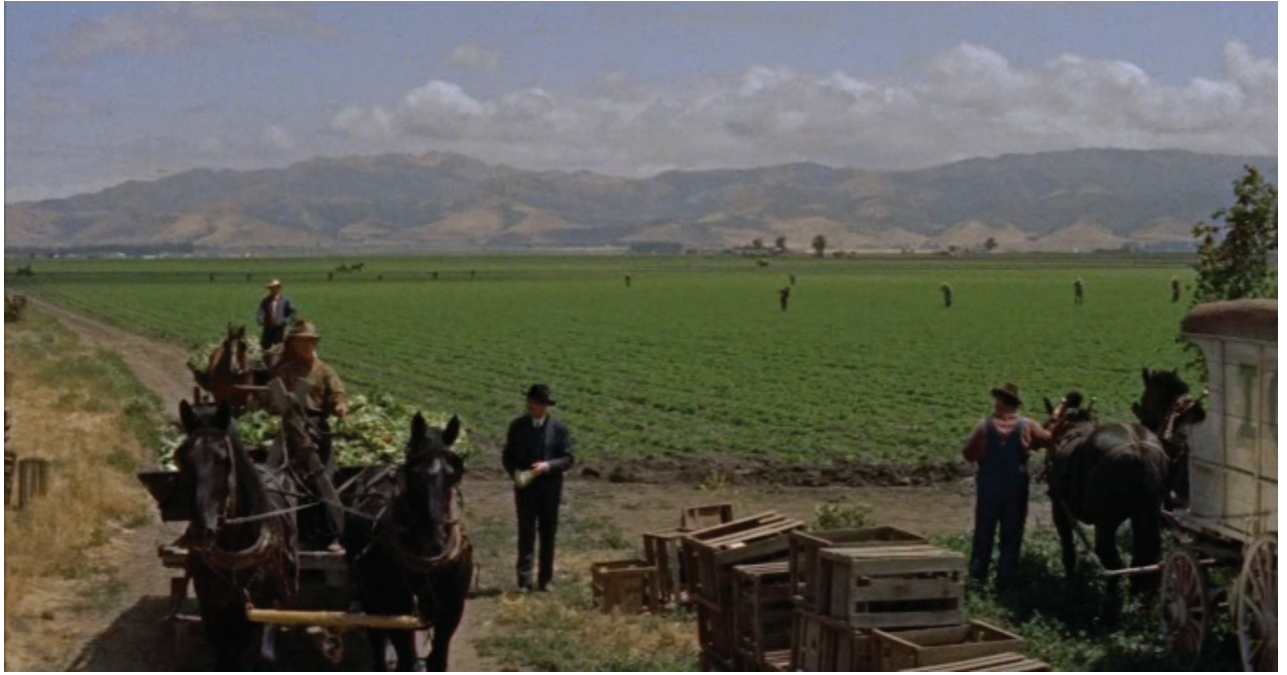
Figure 2. Adam Trask oversees harvest in the lush fields in the Salinas Valley (Kazan, 1955).