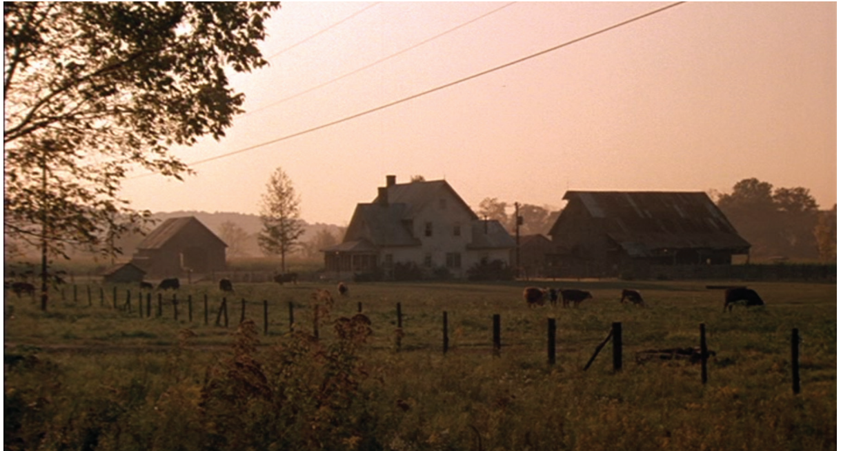
Figure 8. Despite recent flood damage, the Garvey farm at sunrise is a beautiful sight (Cortes, Lewis, & Rydell, 1984).

Perhaps most interesting element of the film's visual magnificence is its creation. The beauty of the Tennessee wilderness is Nature's own, but the filmmakers fashioned the Garvey farm themselves: "The land was turned into the Garvey farm. Workers combined old, worn wood with artificially-aged [sic] lumber to build the farmhouse, barn and various chicken coops, corrals and pigsties on the property, so that they would blend in with the century-old homesteads in the valley" (Fein, 1984, para. 14). The farm had to be fabricated to fulfill both the film's narrative and the director's dramatic vision for the work. The finished product seems incomplete, however, especially compared to the authenticity of Country's set decoration. The barn, though antiqued, feels orderly, the old harnesses and tools hung just so, the cattle residing in individual stalls, the goats roaming the property freely.