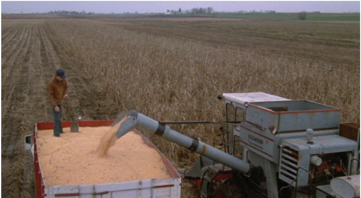
Figure 7. Gil and Carlisle Ivy bring in the harvest on a chilly Midwestern fall day (Lange, Witliff, & Pearce, 1984).