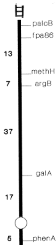
Figure 1. Relevant parts of linkage group III of A. nidulans showing the location of fpa86 with respect to other markers