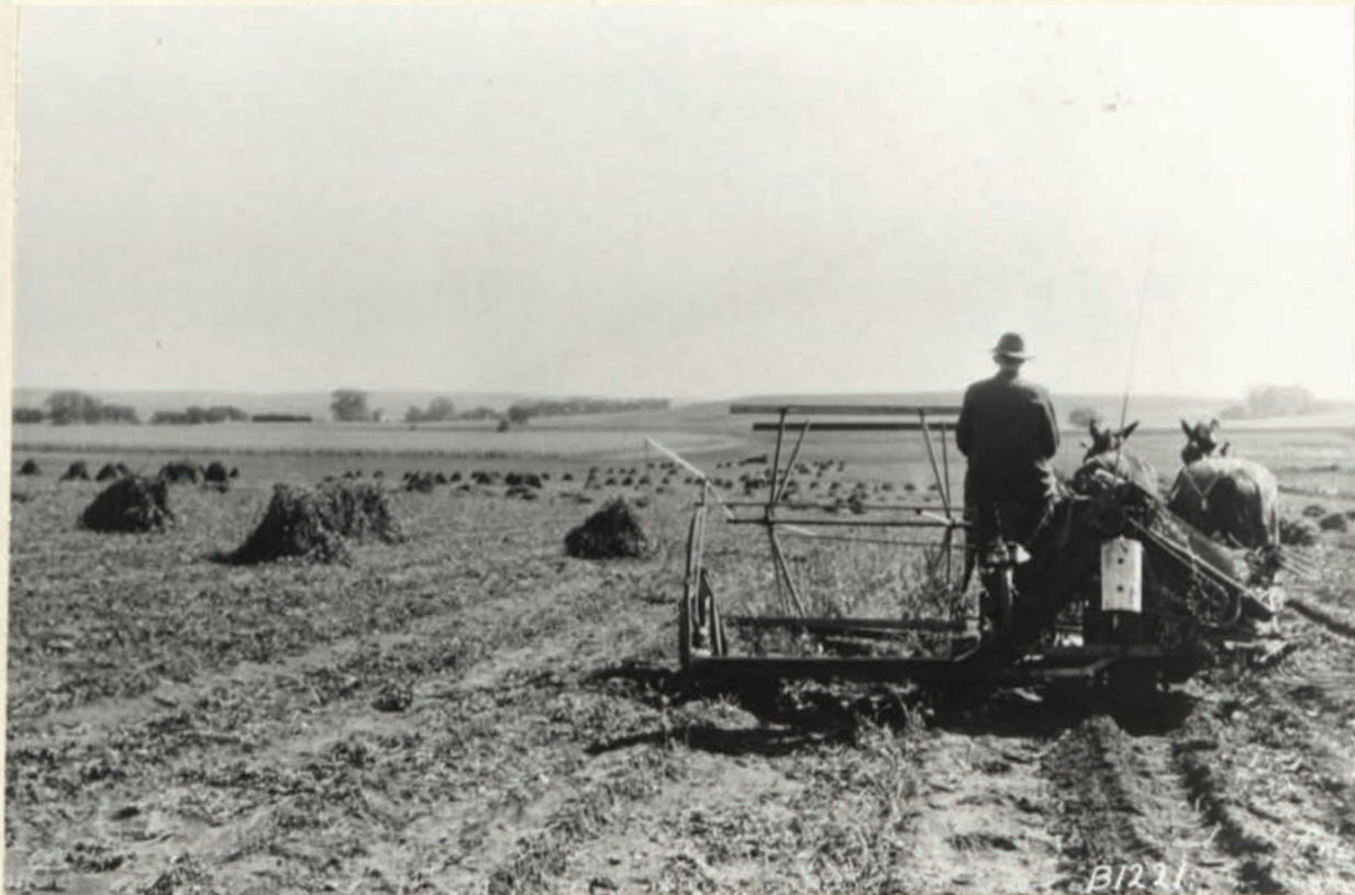
Harvesting Soy Beans w/ binder 9/29/1924

Since its inception in 1863, Kansas State University has been developing a reputation for being home to numerous world-class food-focused research facilities and faculty experts, as well as a training ground for the next generation of researchers.