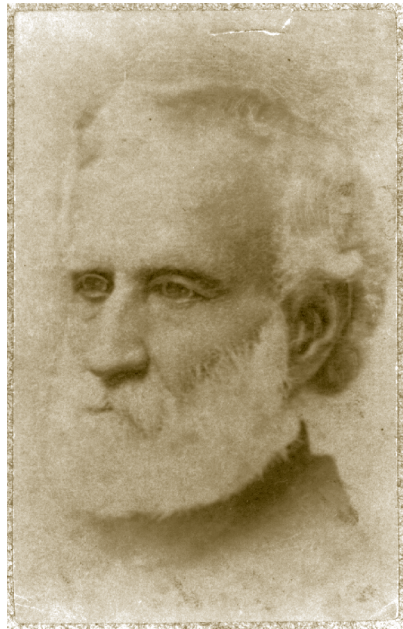
T. T. FAUNTLEROY, COLONEL FIRST DRAGOONS CIRCA 1870s

In order that my objection may not be considered captious, I now propose to give you some facts which I think will justify my opinion in that regard, and will be of importance to your department in an economical point of view at least. By a simple view of the map prepared in 1850, in the bureau of topographical engineers, of the United States and its Territories, you will perceive that a common road can be obtained from Fort Leavenworth to Oregon and Santa Fe, at or near a point on the Kansas rive[r] where the Republican Fork unites with it. This will be in advance of the first-mentioned point about two hundred and fifty miles. Here are the finest land and the best timber in all the western world—capable, the first, of the highest production by cultivation, and the latter affording the most abundant and suitable supply for building materials. It is admitted by all that the attainment of a common route to the several points west of Fort Leavenworth, in several hundred miles, would