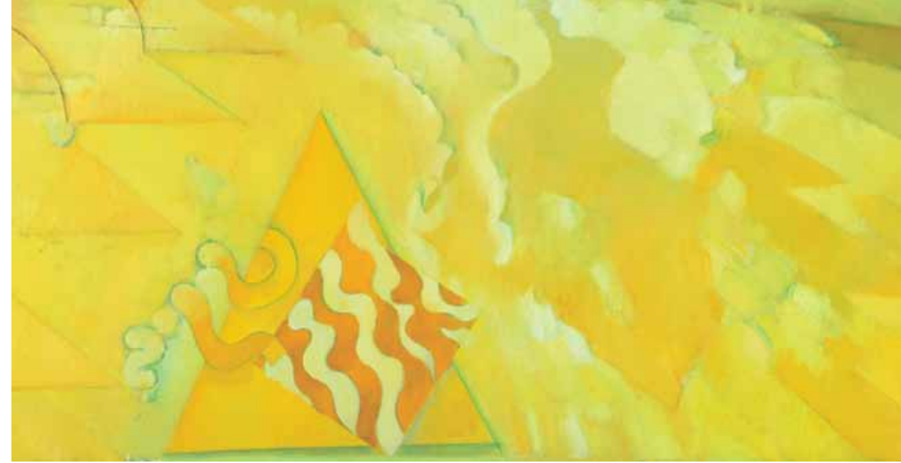
WIND OVER LONG GRASS (DETAIL)

Fences were unknown to the pastoralists like those who first appeared in Greco-Roman literature