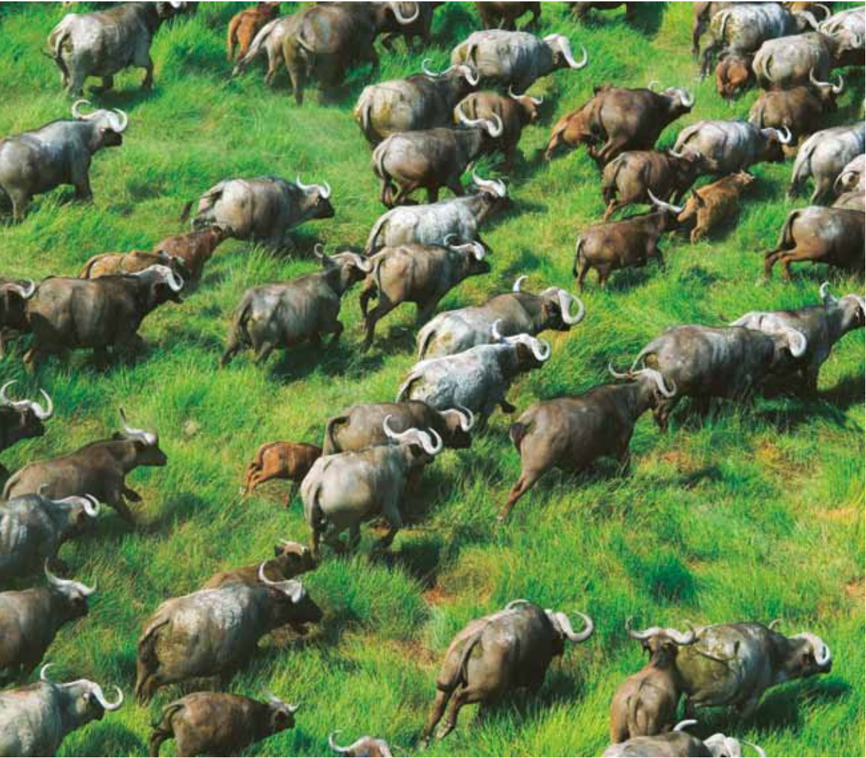
AERIAL VIEW OF CAPE BUFFALO Martin Harvey