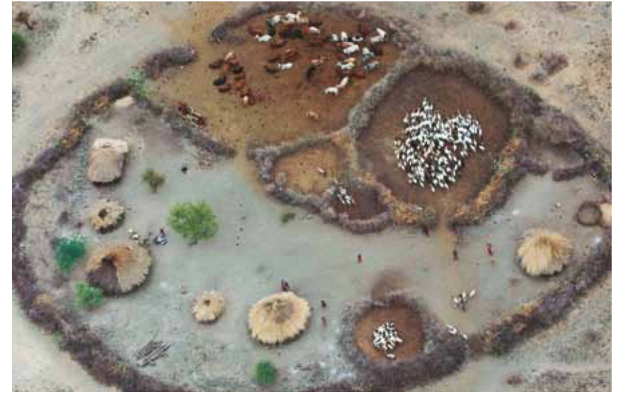
AERIAL VIEW OF MAASAI HUTS OR OMA