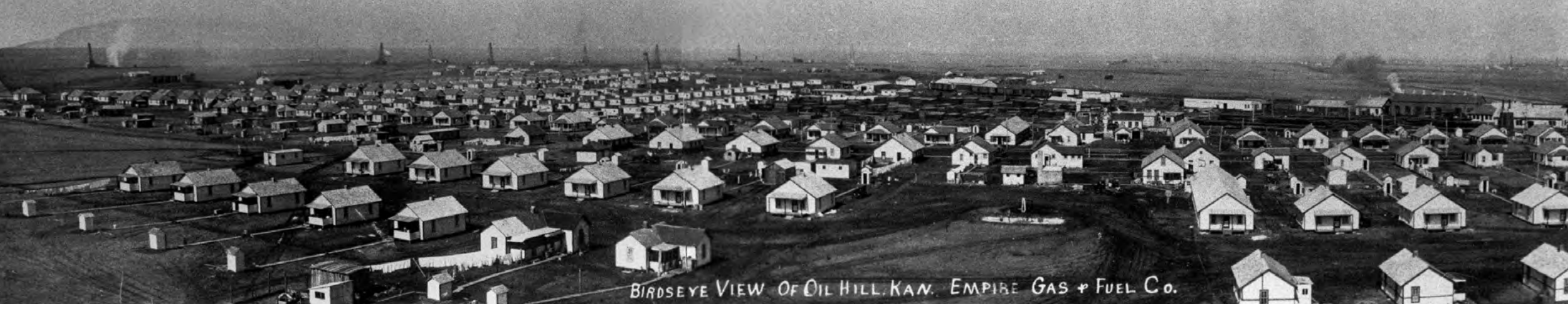
BIRDSEYE VIEW OF OIL HILL, KANSAS, EMPIRE GAS & FUEL CO.

exploded, burgeoning from 3,000 to 20,000 between 1915 and 1920.