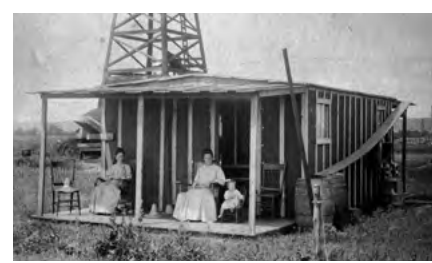
EL DORADO, KANSAS – OIL FIELD CIRCA 1917

As the nation's oil supplies increased, oil prices, which were as high as three dollars and fifty cents per barrel in 1915, plunged as low as sixty-six cents in 1933. With oil profits waning, many of the