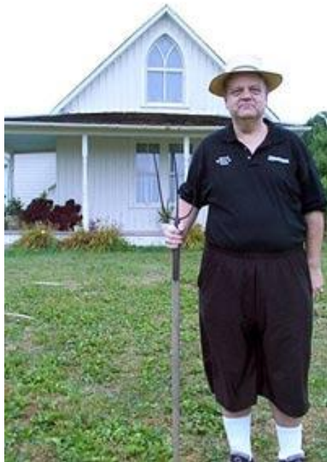
Figure 5 - The caretaker of the American Gothic House photographed in 2002, courtesy NPR

Phase one restored and stabilized the Gothic House and was completed in the mid-1990s. Eventually the building was listed on the National Register of Historic Places and Eldon's postmaster was persuaded to move in full-time. Phase two developed "American Gothic Park South," a greenbelt and rest area for road-weary tourists. Plans for a new visitor center became the focus of the final phase, and the community worked together to make this goal a reality. In December of 2004, the Eldon City Council passed a resolution to cover the last several thousand dollars needed to match other grants obtained from the Iowa Historical Society and money raised from the community through fundraising, encompassing everything from raffles to bake sales, to hawking t-shirts and commemorative Christmas ornaments. In June of 2007, the third phase was finally completed with the opening of a new visitor center. 43 The center contains a variety of exhibits on the significance of the painting, the career of Grant Wood, his relationship to his sister, Nan Wood Graham and his connection to the community of Eldon. One section is devoted entirely to parodies of the iconic painting and perhaps most amusingly, visitors have the opportunity to "borrow a costume and pitchfork to make your own American Gothic portrait in front of the original house." 44