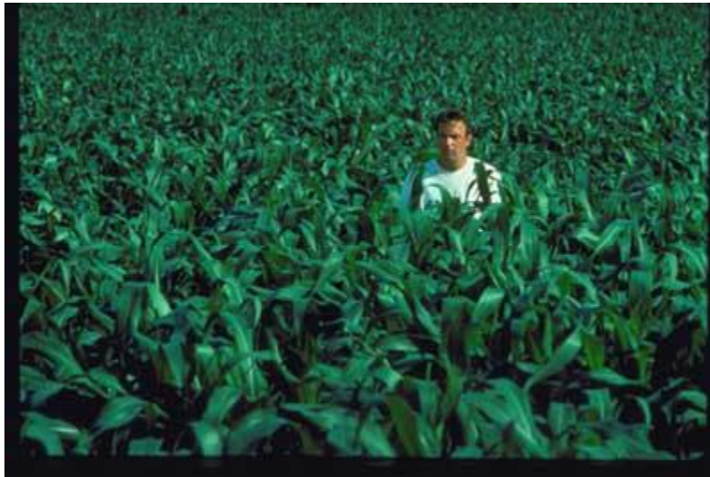
Figure 3 - Kevin Costner as Iowa farmer Ray Kinsella in Field of Dreams

More than thirty years after The Music Man debuted on Broadway, the film Field of Dreams was released in 1989. Based on the 1982 novel Shoeless Joe by W.P. Kinsella, the film version starred Kevin Costner as an Iowa farmer who hears the mysterious words "If you build it, they will come," and is compelled to build a baseball diamond in the middle of his cornfield. The idealistic farmer’s persistence is rewarded when spirits from baseball's past begin appearing on the landscape. The film struck it big at the box office as millions of moviegoers found themselves caught up in a nostalgic rural fantasy that highlighted the redemption not only of an Iowa corn farmer, but also of the disgraced ghosts of the Shoeless Joe Jackson and the other Chicago White Sox banned from the game for throwing the 1919 World Series. 29