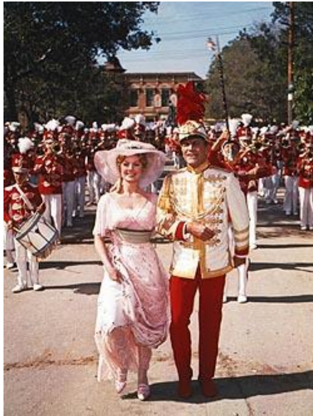
Figure 2 - Closing scene from 1962 film version of The Music Man

Perhaps more than any other musical, The Music Man is an idealized slice of Americana, a popular representation of a turn-of-the century community with powerful connections to geography, language and behavior of a resolutely American place – small town Iowa. It is common knowledge that Willson based The Music Man on his nostalgic reflections of his hometown, Mason City, a small but thriving town in north central Iowa. To understand the musical's popularity within a contextual framework, it is helpful to examine the popularity of another "heartlandesque" representation from late 1950s America.