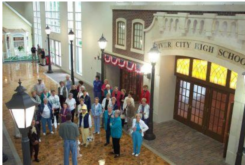
Figure 4 - A group taking a tour of "Music Man Square,"

Although Meredith Willson retained his connections to Mason City throughout his life, his rosy portrait of small town Iowa faded a bit from memory after he died in the early 1980s. It was not until the late 1990's that Willson's contributions to Mason City became a much bigger point of civic pride. A booster mindset re-emerged in the community. His boyhood home was purchased by the Mason City Foundation from private owners and restored to its 1912 look. The Foundation also raised $10 million to build "Music Man Square," a museum complete with recreated pool hall, soda fountain and barbershop. Music Man Square opened in 2002, a year that also marked what would have been Willson's 100 th birthday. 40