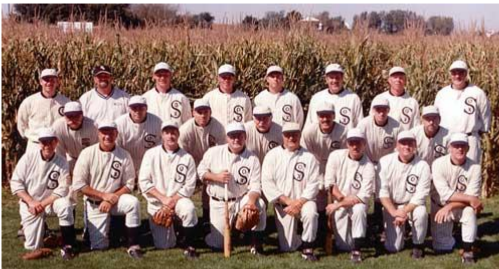
Figure 6 - The 2004 Ghost Players Team